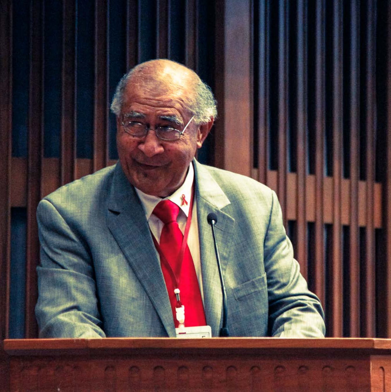
H.E. Ratu Epeli Nailatikau, President of Fiji and Chairman of the Meeting