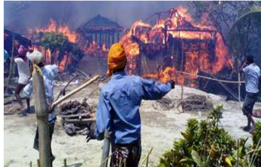
2012 (May), a big fire in Siraha District, burning around 1000 houses affecting 2063 people