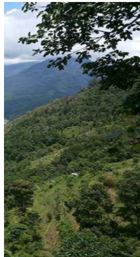
landslide, affecting around thousands of people in upper and lower river stream