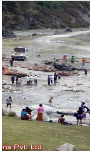
Food at Seti River, near around 30 small