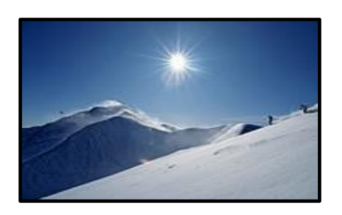
8000 κm² – eternal glaciers