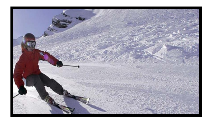
80 touristic zones