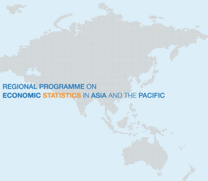
REGIONAL PROGRAMME ON ECONOMIC STATISTICS IN ASIA AND THE PACIFIC