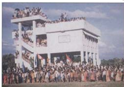
119 cyclone shelters were constructed by Japanese Grant Aid.

Victims of cyclones and floods were drastically reduced with the increase in the number of cyclone shelters and meteorological radars.