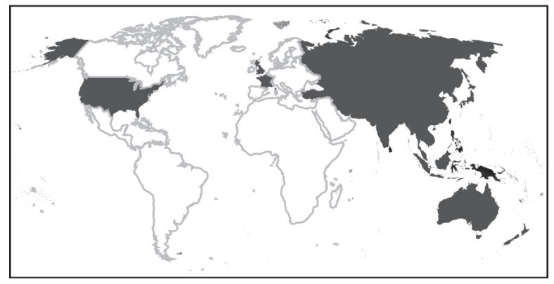
The shaded areas of the map indicate ESCAP members and associate members.

ESCAP is the regional development arm of the United Nations and serves as the main economic and social development centre for the United Nations in Asia and the Pacific. Its mandate is to foster cooperation between its 53 members and 9 associate members. ESCAP provides the strategic link between global and country-level programmes and issues. It supports Governments of countries in the region in consolidating regional positions and advocates regional approaches to meeting the region's unique socio-economic challenges in a globalizing world. The ESCAP office is located in Bangkok, Thailand. Please visit the ESCAP website at www.unescap.org for further information.