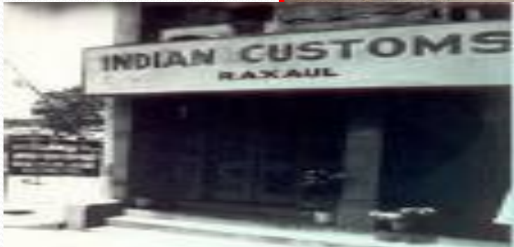
RAXAUL- CUSTOMS OFFICE IN THE MIDDLE OF MARKET PLACE