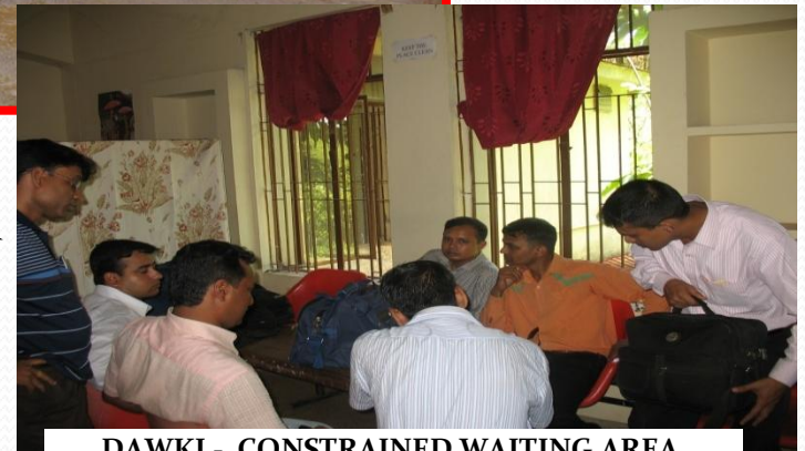
DAWKI - CONSTRAINED WAITING AREA