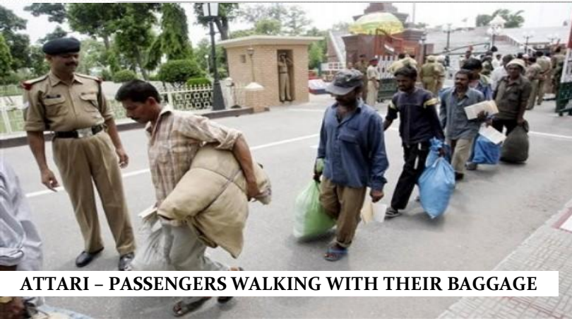
ATTARI - PASSENGERS WALKING WITH THEIR BAGGAGE