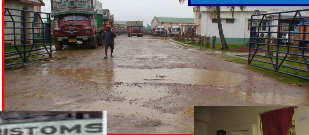
AGARTALA CUSTOM STATION