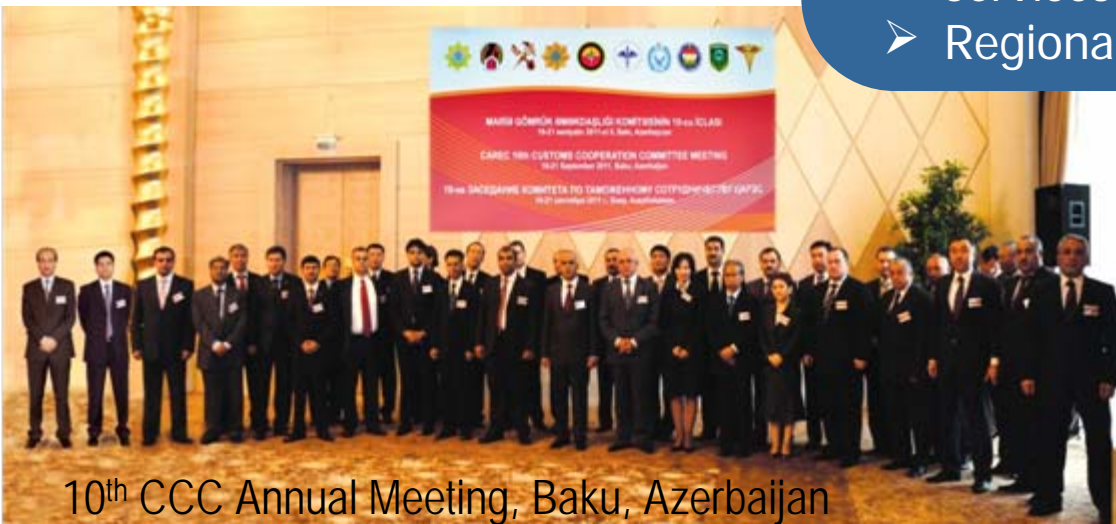
10 th CCC Annual Meeting, Baku, Azerbaijan

Annual meetings review each country's progress on 5 priority areas