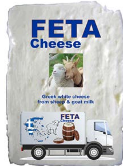
BUSINESS PROCESS ANALYSIS OF FETA CHEESE EXPORTS FROM GREECE TO RUSSIA