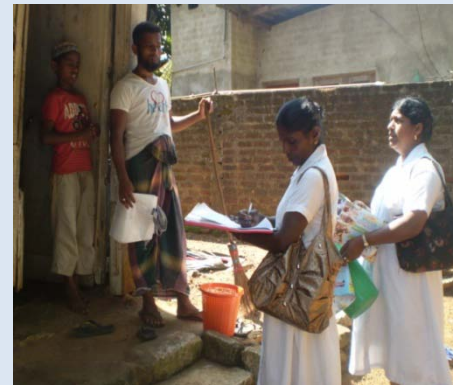
Door to door awareness