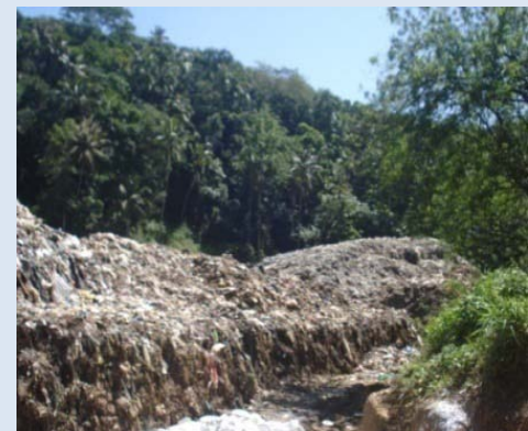
Dumpsite in Matale