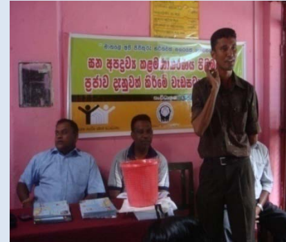
Open house awareness