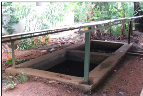
Leachate collection tank