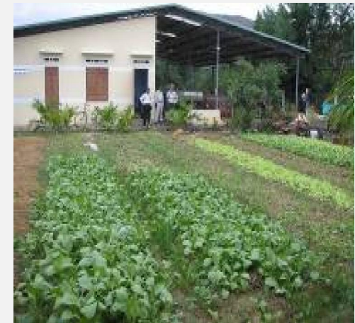
Organic farm, IRRC