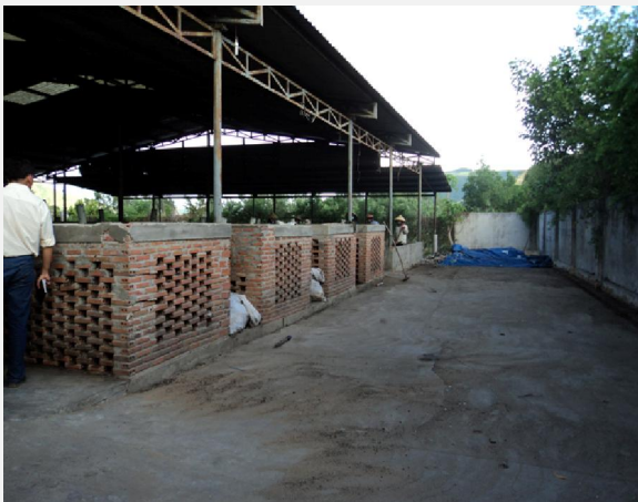
IRRC, Nhon Phu