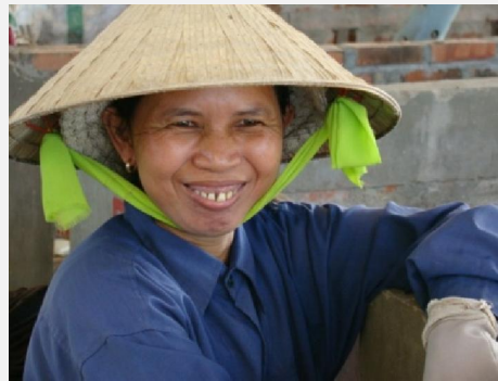
Cooperative with six female members