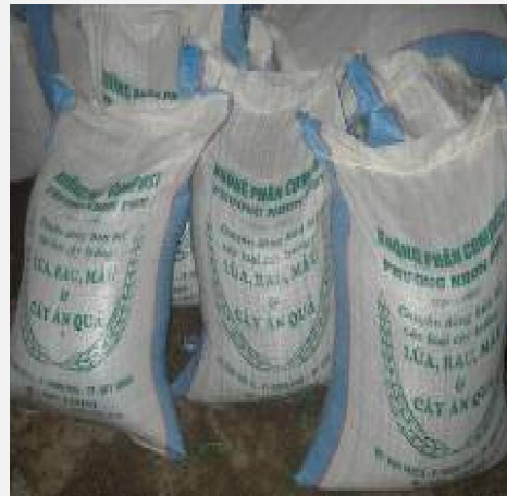
Compost bags, IRRC