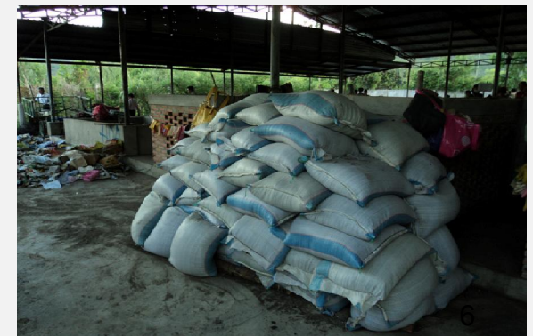
Packed compost bags for sale