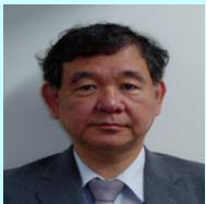
Nominee for UN/CEFACT Rapporteur for Asia and Pacific - Elected HoD Japan