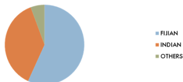
Population By Major Race