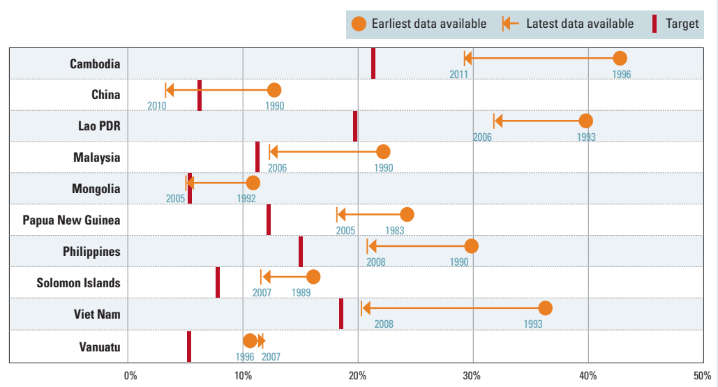
Figure 1. Prevalence of underweight children under 5 years of age (%) in LMICs in the Western Pacific Region, 1983 –2011.