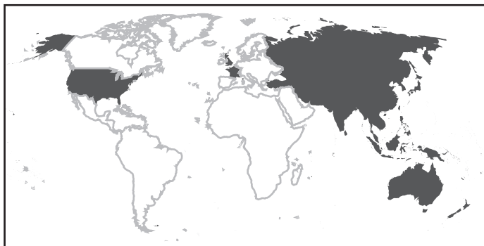
The shaded areas of the map are ESCAP members and associate members.

The United Nations Economic and Social Commission for Asia and the Pacific (ESCAP) is the regional development arm of the United Nations and serves as the main economic and social development centre for the United Nations in Asia and the Pacific. Its mandate is to foster cooperation between its 53 members and 9 associate members. It provides the strategic link between global and country-level programmes and issues. It supports Governments of countries in the region in consolidating regional positions and advocates regional approaches to meeting the region's unique socio-economic challenges in a globalizing world. The ESCAP secretariat is located in Bangkok, Thailand. Please visit the ESCAP website at www.unescap.org for further information.