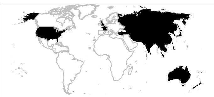
The shaded areas of the map are ESCAP Members and Associate Members

ESCAP is the regional development arm of the United Nations and serves as the main economic and social development centre for the United Nations in Asia and the Pacific. Its mandate is to foster cooperation between its 53 members and 9 associate members. ESCAP provides the strategic link between global and country-level programmes and issues. It supports Governments of the region in consolidating regional positions and advocates regional approaches to meeting the region's unique socio-economic challenges in a globalizing world. The ESCAP office is located in Bangkok, Thailand. Please visit the ESCAP website at < www.unescap.org > for further information.