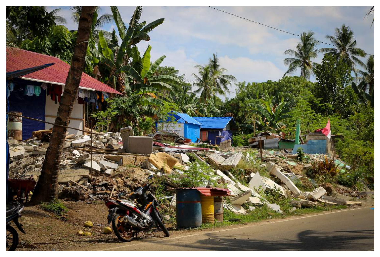
Houses collapsed due to impact of the earthquake.