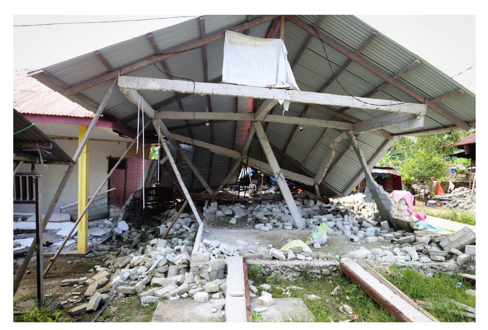
Houses collapsed due to impact of the earthquake.

On September 26, 2019, a large-scale earthquake with a substantial magnitude of 6.5 struck Ambon, Maluku Province, with over 2,500 houses were damaged and 130,000 people were displaced, according to the National Agency for Disaster Management (BNPB).