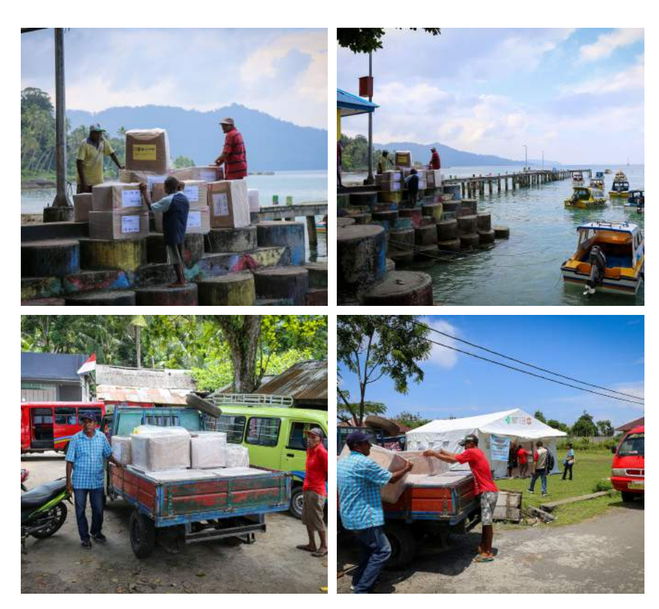
Dignity kits are delivered to affected women carefully yet swiftly.

Through funding from the Australian Department of Foreign Affairs and Trade (DFAT) and with support from UNFPA, the Ministry of Health and the Ministry of Women's Empowerment and Child Protection distributed hygiene kits, maternity kits, post-delivery kits, and new-born kits, as well as established and administered three reproductive health (RH) tents to provide core lifesaving SRH services vital for the health and dignity of women and girls.