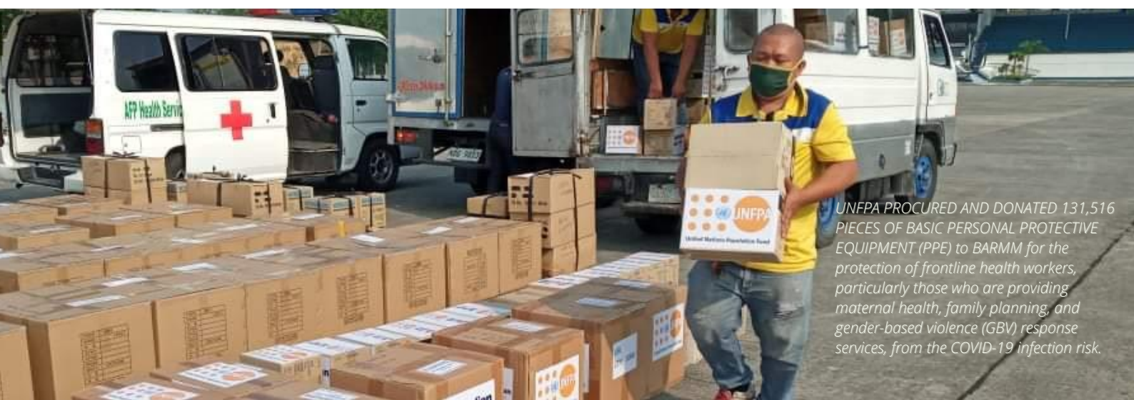
UNFPA PROCURED AND DONATED 131,516 PIECES OF BASIC PERSONAL PROTECTIVE EQUIPMENT (PPE) to BARMM for the protection of frontline health workers, particularly those who are providing maternal health, family planning, and gender-based violence (GBV) response services, from the COVID-19 infection risk.

While UNFPA continued its response to the population displacements caused by the series of earthquakes in Mindanao and the Taal Volcano Eruption, it quickly integrated and adjusted its efforts with the new demands of the pandemic. Since the beginning of the year, UNFPA provided all possible assistance to the national and local governments led COVID-19 responses with a view to contributing to “building back better and differently” by meeting the unique needs and rights of women and girls. UNFPA donated hand-held thermometers, personal protective equipment (PPE), triage tents and Dignity Kits to the Department of Health (DOH) and its designated COVID-19 referral hospitals in NCR and Taal Volcano eruption affected areas, as well as to BARMM, especially for the protection of frontliners working on maternal health and GBV. To date, UNFPA has provided a total of USD 496,000 worth of donations for health workers and hospitals in coordination with DOH. UNFPA amplified its communication activities to reinforce advocacy and behavioural change communications (BCC) by publishing a series of video messages on safe motherhood, family planning and anti-domestic violence amid COVID-19. UNFPA also developed the Policy Paper, “Bayanihan to Heal As One Act (COVID-19 Response)”, for the Philippine Senate to advocate for the continuity of the essential services including for SRHR and GBV while focusing on COVID-19. This Policy Paper has been cited by the DOH in its daily media brief as well.