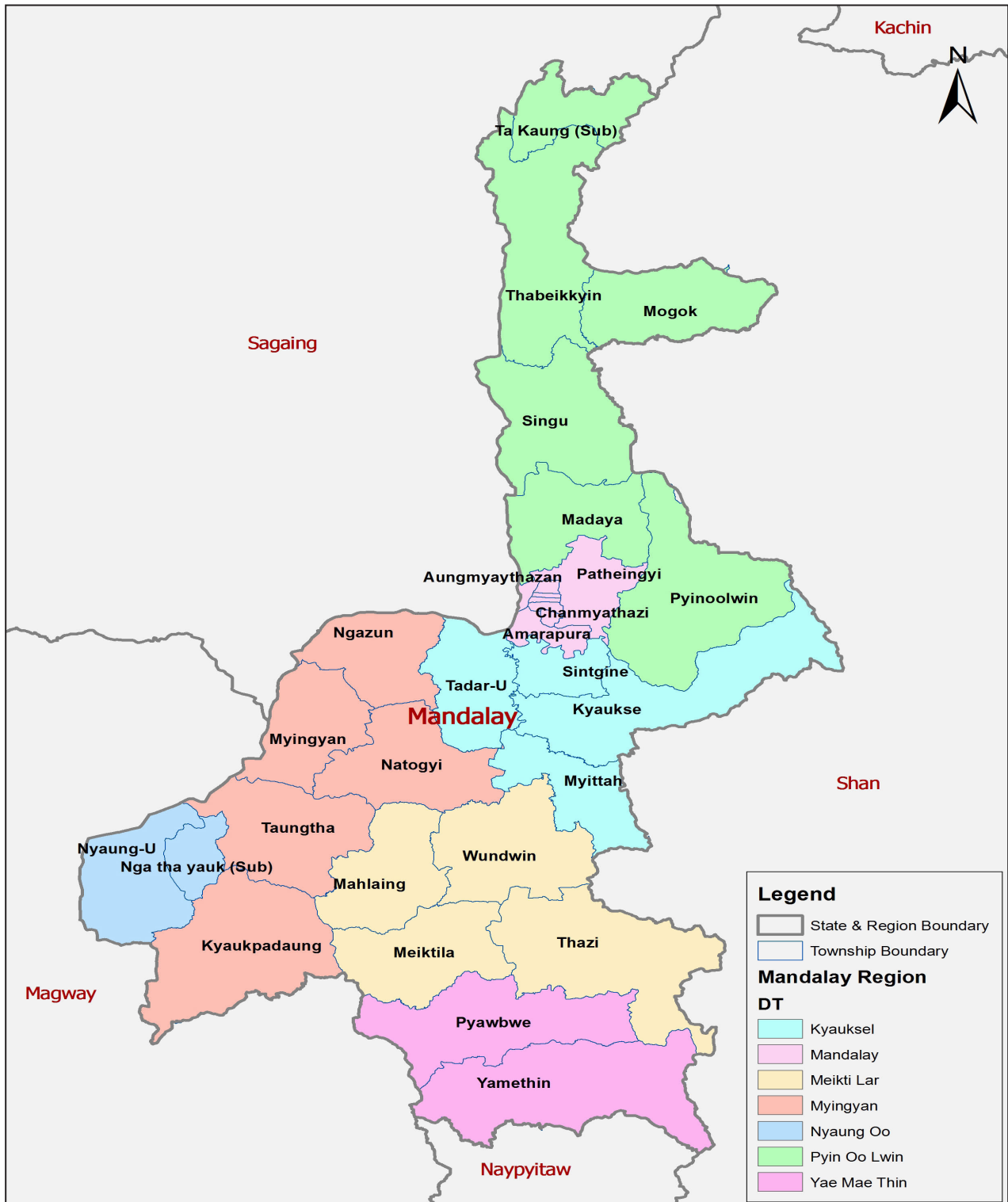
Figure 2: Map of Mandalay Region, Districts and Townships