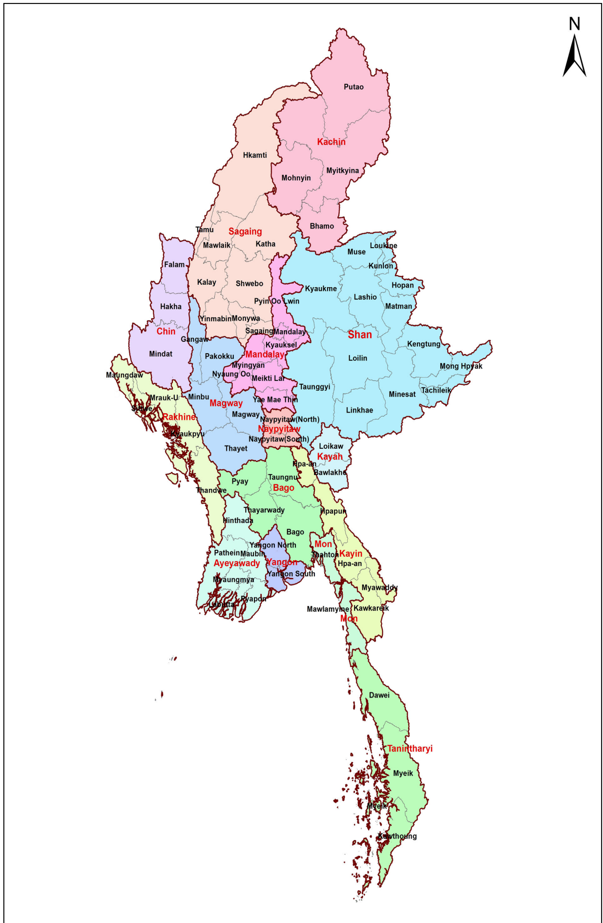
Figure 1: Map of Myanmar by States/Regions and Districts