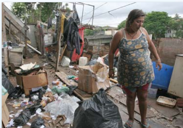
Carina Wint / UNFPA

Mental, physical health and social conditions are three vital strands of human life that are deeply interdependent and interconnected. The prevention and treatment of mental health problems is not only critical to general well-being, but also necessary to prevent problems relating to sexual and reproductive health.