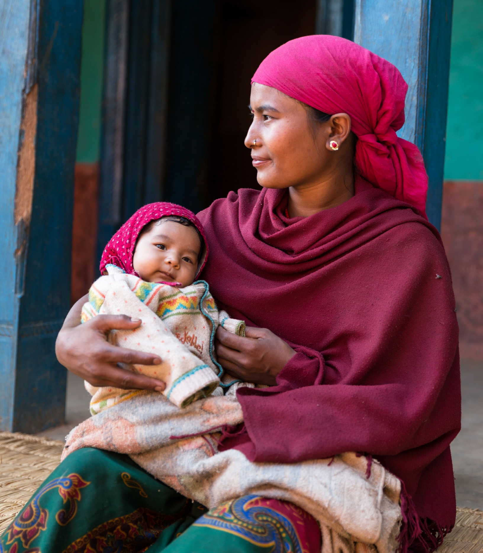
Khiljee, Nepal.