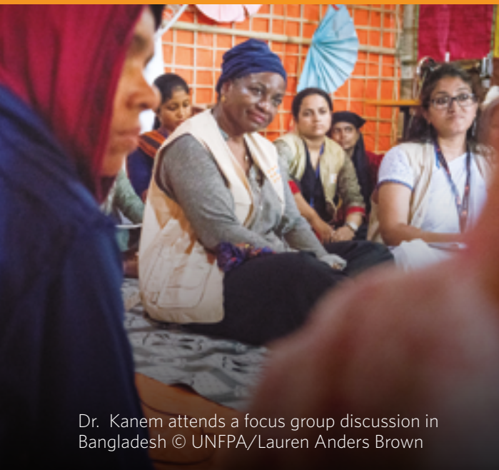
Dr. Kanem attends a focus group discussion in Bangladesh