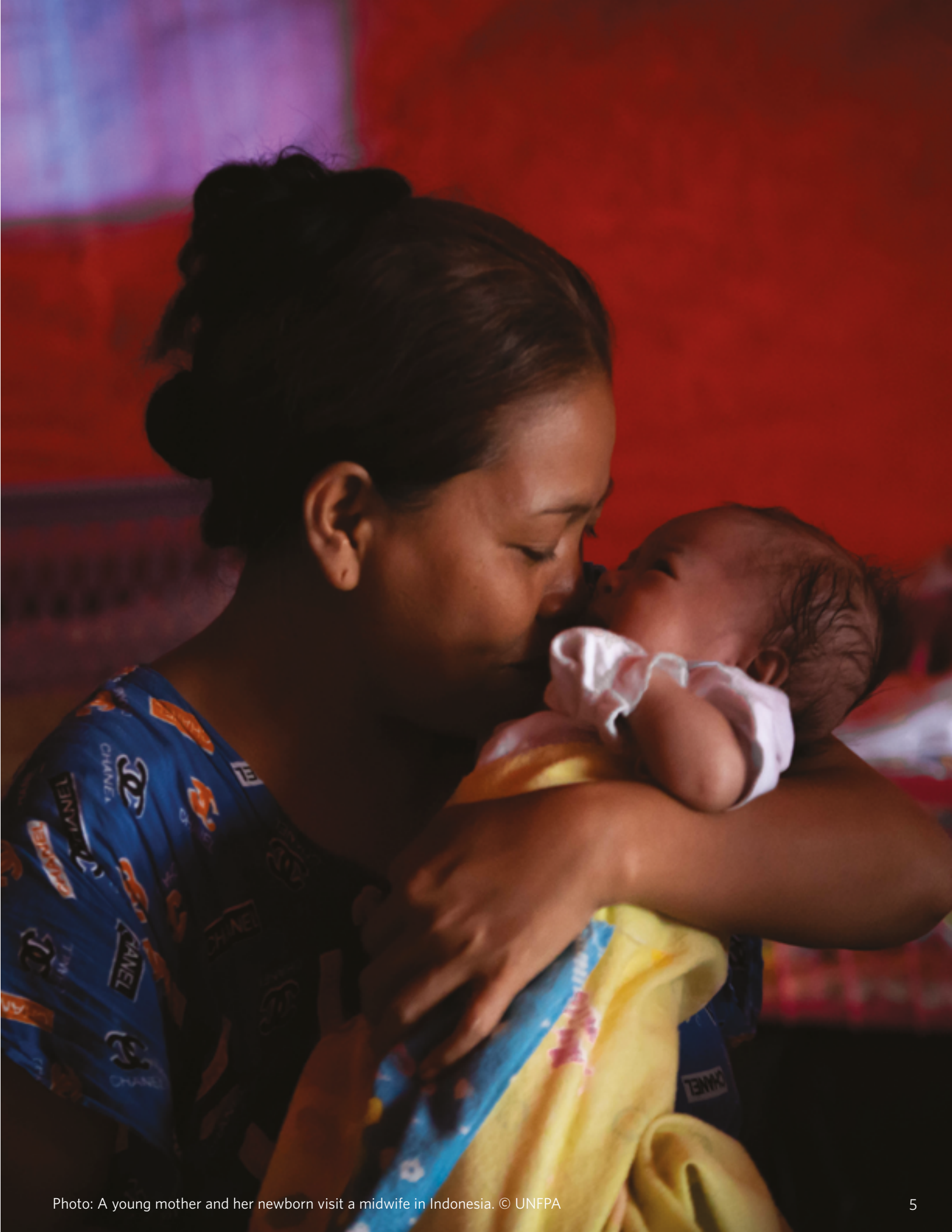
Photo: A young mother and her newborn visit a midwife in Indonesia. © UNFPA