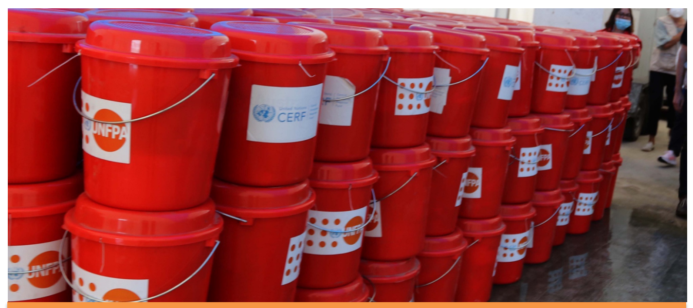
To date, UNFPA has distributed:

Emergency kits to provide clean delivery supplies for 1800 births Midwifery packs to equip 35 midwives providing outreach in the community Primary care level equipment for 315 deliveries Referral level medications and equipment for 225 cesarean deliveries and 90 obstetric emergencies Medications and supplies to respond to sexual violence for 250 women and 50 children through clinical management of rape