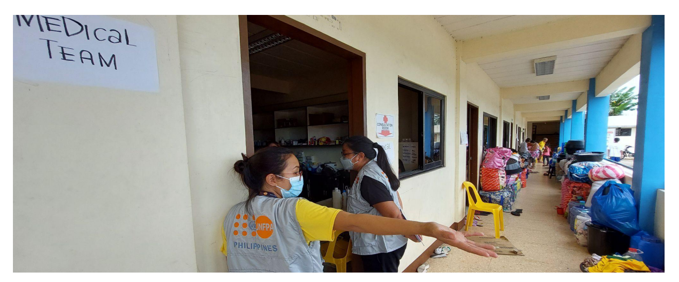
UNFPA field team in Southern Leyte supported a Mental Health and Psychosocial Support (MHPSS) intervention for displaced families affected by Tropical Storm Agaton in April 27, 2022

The Commission on Election (COMELEC) issued a resolution on the prohibition of any public official or employee to release, disburse or expend public funds, effective March 25, 2022 until May 8, 2022. This prevented government agencies from directly disbursing cash, food, and material assistance to survivors of GBV, especially at crisis centers. The GBV Sub-Cluster, working with the Protection Cluster, continued its advocacy for the principles of Centrality of Protection, Do No Harm and Accountability to Affected Populations (AAP).