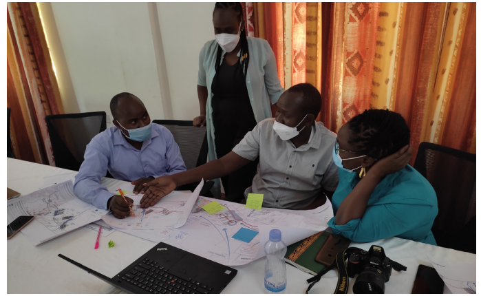
Turkana County representatives discussing proposed Kakuma-Kalobeyi Vision goals and map.

UN-Habitat, in collaboration with Turkana County Government and Cities Alliance, hosted a collaborative workshop to discuss ongoing projects within the region - to present the County Government representatives with a spatial vision for Kakuma-Kalobeyi which has been informed by the Kakuma-Kalobeyi Spatial Profile, socio economic surveys and extensive community consultation, and to examine the goals and strategies that comprise the vision and propose possible action areas for priority projects. In addition, the workshop also provided key updates on the