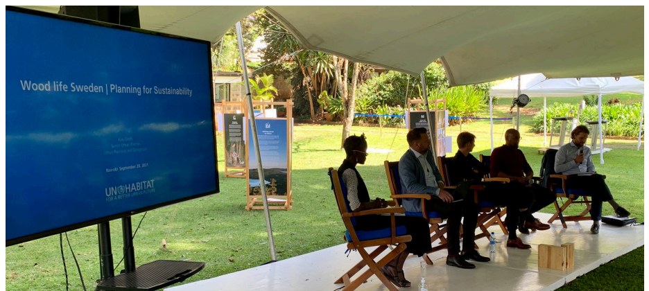
UN-Habitat joins as panelist in session Planning for Sustainability in Woodlife Sweden event.

Since 2016, UN-Habitat, in partnership with Turkana County Government and UNHCR, has developed and planned for an integrated settlement – the 'Kalobeyi Settlement' in the region, to support both host and refugee communities. Within the settlement, UN-Habitat and partners (Peace Winds Japan, GIZ Sports 4 Development, Block by Block Foundation), have over the years designed and expanded the public spaces to serve the needs of these beneficiaries better.