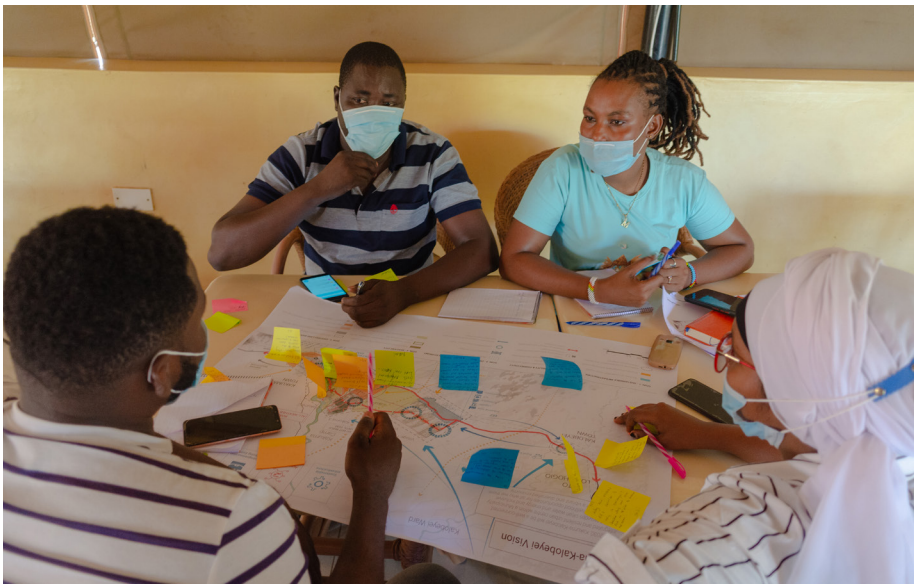
Workshop participants discussing the Kakuma-Kalobeyei Vision.

UN-Habitat, in collaboration with Turkana County Government and Cities Alliance, hosted a collaborative workshop with leaders from the host and refugee communities in Kakuma-Kalobeyei for a project funded by the European Union Trust Fund and Swiss Agency for Development and Cooperation (SDC).