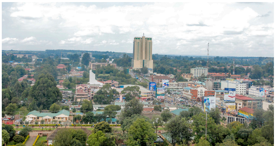
Aerial view of Eldoret town, Eldoret, Kenya.