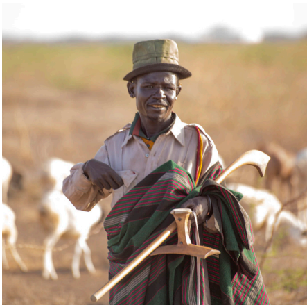
A herder looking after livestock in Natukabenyo village, Kakuma, Kenya.

the planned the Lamu Port-South Sudan-Ethiopia-Transport (LAPPSET) corridor. The transport infrastructure investments will also enhance linkages between Turkana West and the North Rift Economic Bloc (NOREB), especially the main urban centers of Eldoret and Kitale.