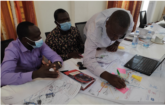
Turkana County representatives discussing proposed Kakuma-Kalobeyi Vision goals and map.