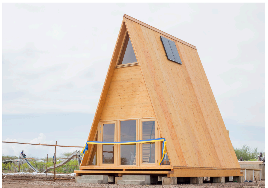
The ARVET-UN-Habitat Community Hall erected in Kalobeyei Settlement Public Space 2.