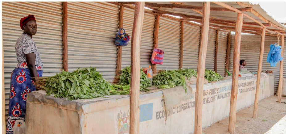
A vegetable seller in Kalobeyi, Kalobeyi, Kenya.

The exercise documented UN-Habitat's surveying process which aimed to better understand the prevailing socio-economic conditions in the region. The filming and photography captured narratives from the county government, development agencies, local businesses, financial institutions, CBOs, hosts and the refugee communities. The narratives and photos illustrated the following thematic scopes: