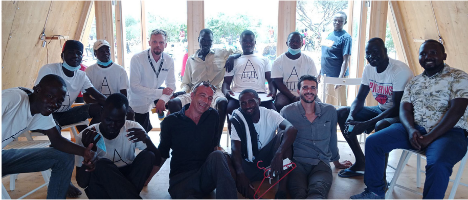
Construction team consisting of ARVET, UN-Habitat and community members.

UN-Habitat, ARVET Developers and partners came together to host an inauguration ceremony for the newly installed UN-Habitat ARVET Community Hall in Kalobeyei Settlement Public Space 2. On the site were the Turkana County Government, the Refugee Affairs Secretariat, ARVET Developers, Community representatives and the UN-Habitat field officers. The event was a great success, drawing the attention of onlookers. It was carried out with all protocols observed during the COVID-19 pandemic, and was also livestreamed virtually with participants joining online.