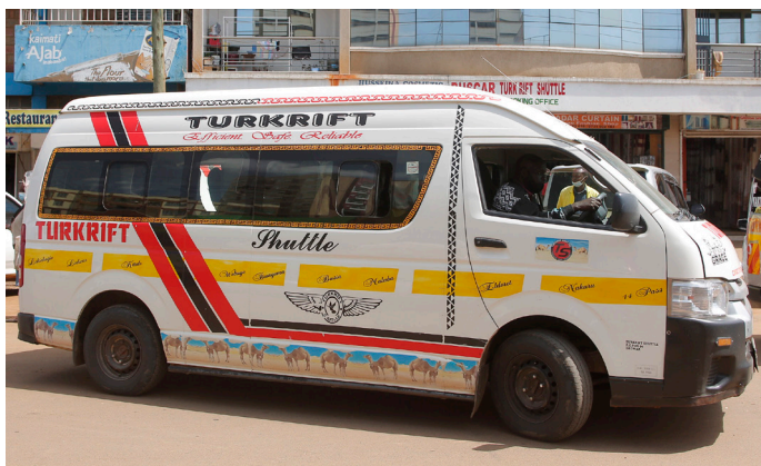
Turkrikt Matatu, a line of Matatu that operates between Eldoret and Kakuma.