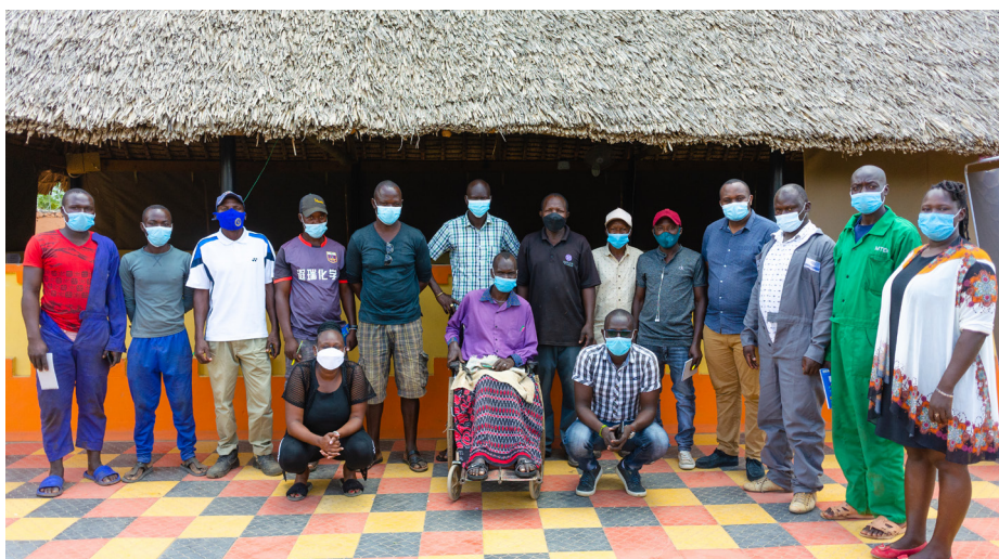
Participants from the Light Industry Association.

In partnership with Cities Alliance, UN-Habitat organised six workshops with Turkana County Government Ministry of Trade, Gender and Youth Affairs, Kenya Chamber of Commerce and Industry (KNCCI) and Action Africa Help International(AAHI) to support the formation of three self-organised groups and local industry associations in Turkana West, Kenya. These workshops were organised under the programme 'Sustainable Economic Development Along Turkana West Development Corridor Through Enhanced Connectivity, Kenya' which is funded by the Swiss Agency For Development and Cooperation (SDC) through Cities Alliance.