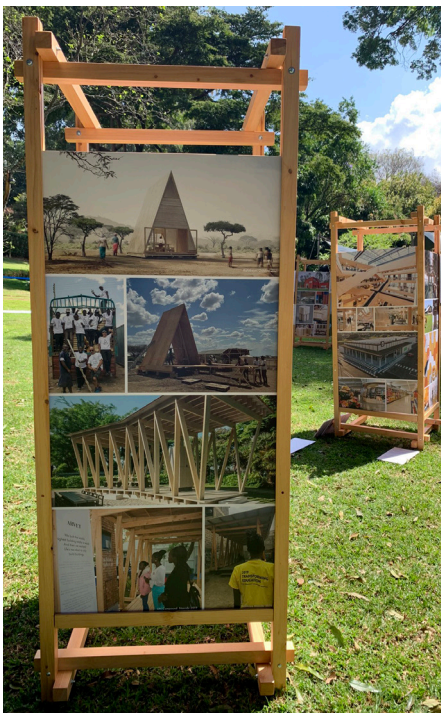
ARVET Developers' present the Kalobeyi Community Hall at the Woodlife Sweden event.

In early 2021, ARVET developers, a Swedish company which has supported construction and design of several notable timber/wood designs internationally, donated a Community Hall module for the Kalobeyi Settlement Public Space 2. The Community Hall was installed by ARVET builders in September (captured in an article below), with the aim to provide a safe space for social cohesion, cultural exchange, and a platform for community activities.