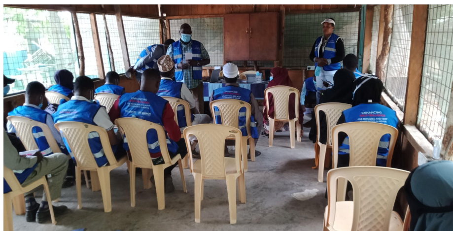
Training of more than 25 research assistants in Daadab Town.

UN-HABITAT in collaboration with Garissa County Government, is undertaking a spatial analysis for Garissa County, in order to develop a spatial profile for Dadaab and Fafi sub counties. This will also assist in re-planning of the two closed camps in Daadab Refugee Complex (IFO2 and Kambioos), for the use by host community, inclusive of the facilities in the camps. This is a component of UN-HABITAT's EUTF (European Union Trust Fund work for Dadaab and is also directly linked to the Spatial Planning & Infrastructure Thematic Working Group under Garissa Social-Economic Development Plan (GISED) led by UNHCR. UN-HABITAT team has already developed the Spatial Profile, which is in the final stages of endorsement.