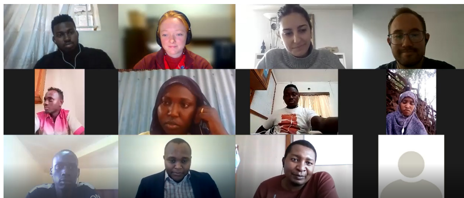
Screenshot of Kakuma Camp Community Planning Group.

CPGs are planned to be formed and engaged in Kalobeyei Settlement and Kalobeyei Town in the near future to ensure all stakeholders are consulted about the visioning of their communities.