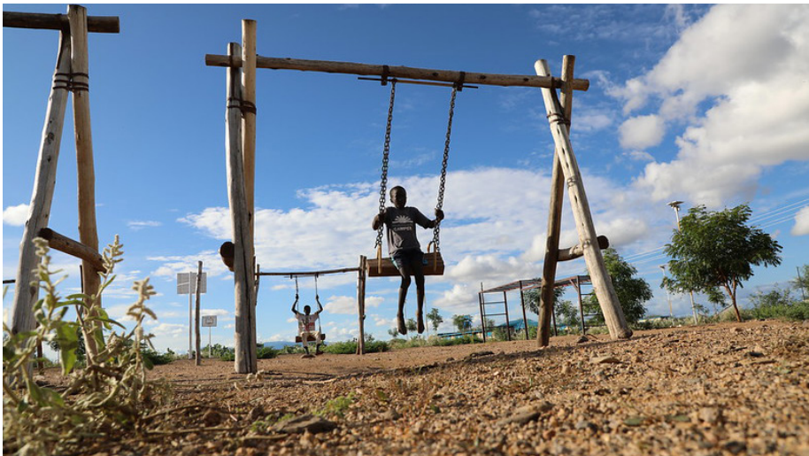
Kalobeyei Public Space, Village 1.

The Government of Japan has donated a total of USD 1,481,263 to UN-Habitat towards the planning and implementation of the Kalobeyei Integrated Settlement which aims to promote integration and peaceful co-existence of the host and refugee communities in settlements in northern Kenya.