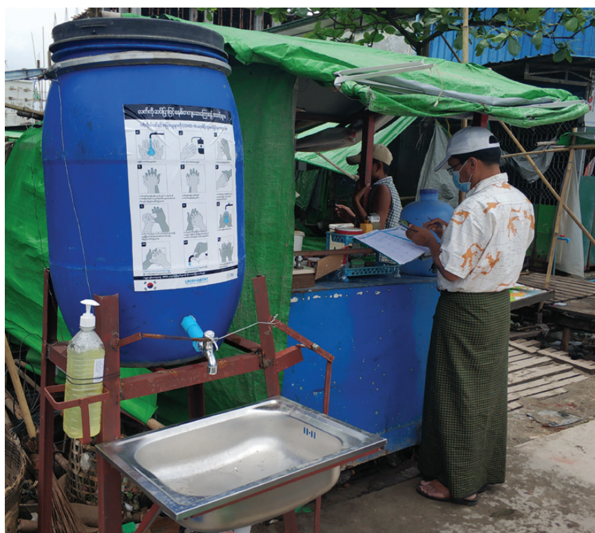
Yangon, Myanmar handwashing station

Also, Urban Law Days and World Metropolitan Day (WMD) were commemorated through virtual trainings and webinars held jointly with universities and local organizations in Colombia, El Salvador, Spain, the United States, and the United Kingdom, among other countries. The PLGS also redirected National Urban Policy Programme funds and Andalusian Agency of International Cooperation for Development grant, United Nations Development Account Project to support the implementation of COVID-19 relief initiatives and demonstration projects in Myanmar, Nigeria, Cameroon, the Democratic Republic of the Congo and Iran.