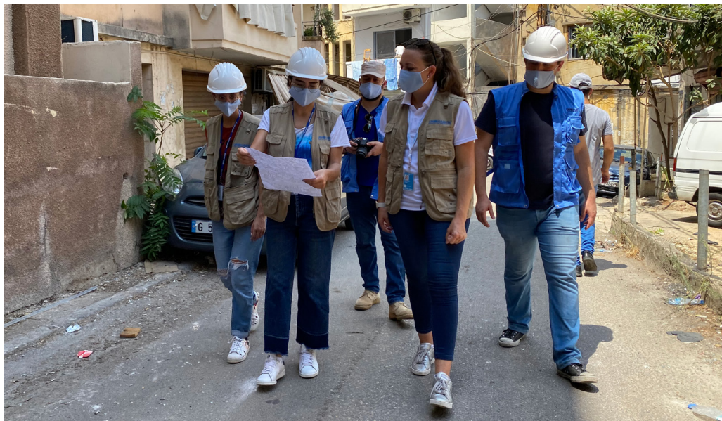
UN-Habitat team responding to the Beirut Port explosion by undergoing a rapid building-level damage assessment in Beirut

formulation of tools and practices that would prioritize urbanization challenges and harness cities as drivers of development. This step should be accompanied by a thorough review and reform of existing legal urban frameworks and tools.