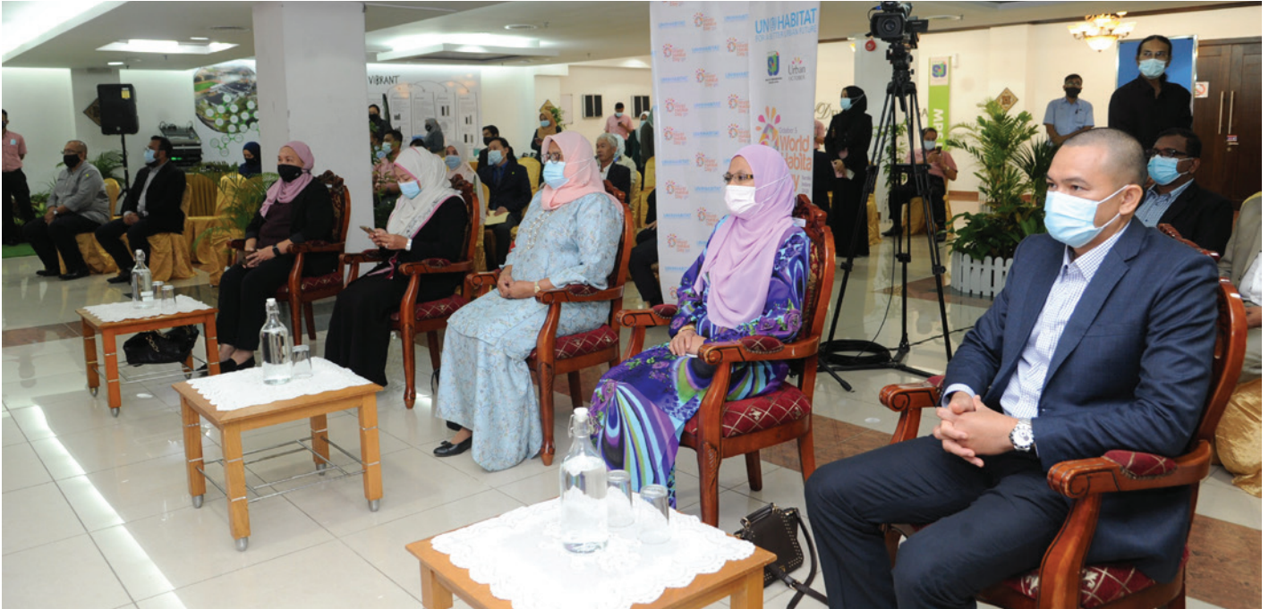
UN-Habitat Executive Director Maimunah Mohd Sharif watches the Global Observance of World Habitat Day 2020 broadcast from Subang Jaya, Malaysia

Colombia's Minister of Housing, City and Territory, Jonathan Malagón, said that his Ministry, which was one of the winners, was one of the youngest in Colombia but they had achieved great results reducing the housing deficit and providing drinking water and subsidies for housing purchases.