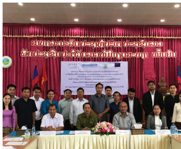
Different tiers of government and other partners come together to discuss low emissions development in the Urban-LEDS Project Advisory Group

Reporting channels for climate change issues are already in place. The Provincial Office of Natural Resources and Environment (PONRE) is the focal point for climate change at the subnational level. It is possible that this existing structure could be used as a building block for institutional responsibilities for MRV. However, PONRE, as well as their District equivalent, DONRE, need additional staff capacity in order to successfully implement climate change related activities. Provincial and District Environmental Committees could be useful forums for enhanced dialogue, exchange and mainstreaming of climate change into sectoral plans, but would need upgrading and strengthening in order to play this role.