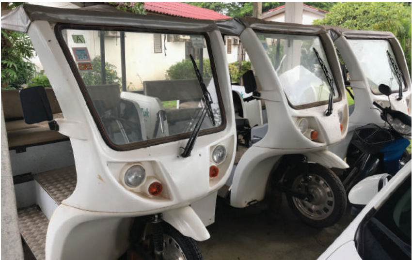
Electric tuk tuks in Pakse City. Transport is a priority area in Lao’s NDC

Governance arrangements for NDC implementation are still under development. Ministries currently report to a governmental “Round Table” via their leadership of individual sector working groups (there are 10 in total). This system could be used for NDC coordination. However, outside of the Ministry of Natural Resources and Environment (MoNRE) and Ministry of Agriculture and Forestry (MAF), NDC awareness among government officials at all levels is limited. One-off trainings have been conducted, but their impact is limited as the learning could not easily be operationalized.