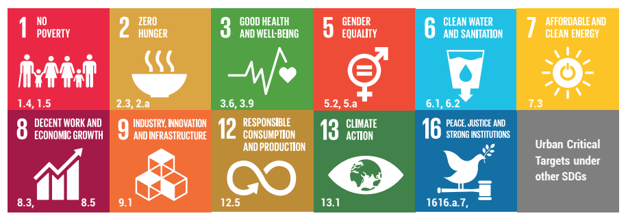
Figure II Urban-critical" Sustainable Development Goals and targets

It is increasingly understood that achieving the Goals requires their localization, and collaboration with local actors, including local governments, and that within cities the localization of the Goals can be most effective.