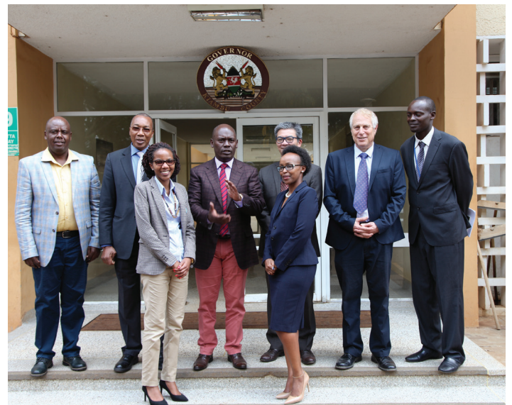
Kiambu County government officials along with UN-Habitat team