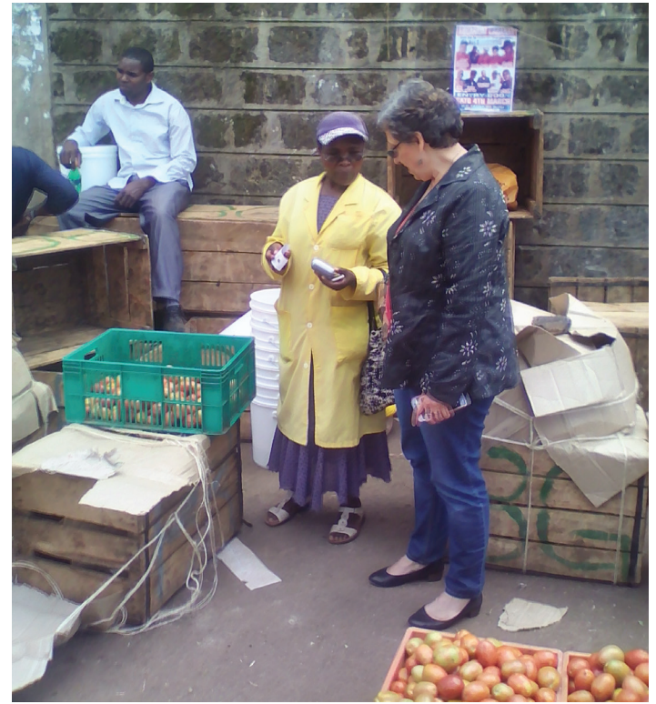
Kiambu County Revenue Staff demonstrating to a UN-Habitat Evaluator how the revenue automation works

Two critical issues have arisen in the course of introducing development fees. Although private developers have expressed support for this initiative, they have indicated the need for a mechanism to ensure that revenues collected will be used strictly for infrastructure development in the area from which funds were collected. Secondly, financial institutions that also express a willingness to provide interim financing, want to see how the return on their funds are guaranteed. These two factors led to the decision to establish a Sustainable Urban Infrastructure Fund (SUIF). In effect, this will function as a revolving fund for infrastructure development in Kiambu. This fund is designed to be a special purpose vehicle fund that will facilitate the financing of infrastructure development. It does so by guaranteeing interim investment funds against bank guarantees provided by private developers as part of the conditions for receiving building permits. This fund will operate with full transparency and is to be overseen by a public board. Part of development fees will be used to replenish funds used to develop infrastructure and the other to recoup investments.