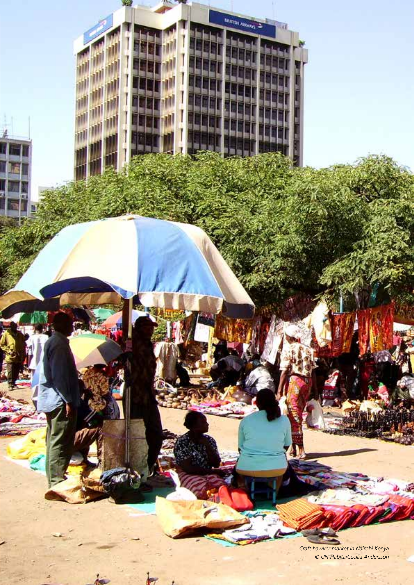
Craft hawker market in Nairobi, Kenya