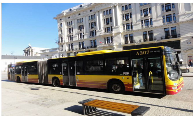
Low emission public bus in Warsaw, Poland

The city's green growth vision includes sustainable transport development as a key component. Warsaw's extensive bus fleet includes 18 buses operating on liquefied natural gas, 10 new electric buses, and a further 15 are fitted with photovoltaic panels – a combined innovative approach clearly exploring different options. The carbon-neutral electric buses were found to be just as durable as diesel buses while being more fuel efficient and less noisy, representing a preferable option for replication in the two delegates' home cities. An additional interesting consideration is the reduction of air pollution from transport, which is much needed in densely populated cities.