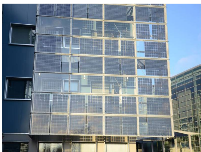
Solar panels on the Viikki Environment House in Helsinki, Finland