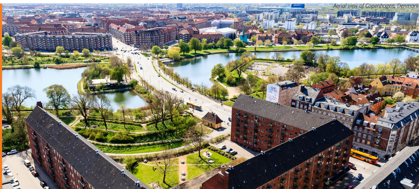
Aerial view of Copenhagen, Denmark