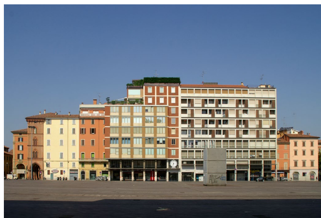
Otto Agosto Square in Bologna

The delegates studied Bologna's Sustainable Energy Action Plan (SEAP) and 2007 Energy Plan, gaining a comprehensive insight into the city's energy strategies and how these are integrated. Further, the delegates explored how the city has managed public-private partnerships (PPPs) and how innovative technology can improve energy efficiency. This is done for example by stimulating the green economy