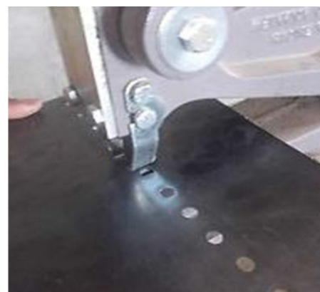
Step 3: Punch the holes in the sheet metal.