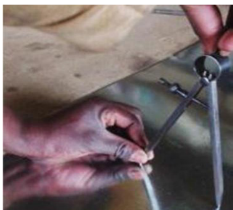
Step 1: Mark out the dimensions of the various stove pieces.

The following steps are followed in the construction of a gasifier stove.