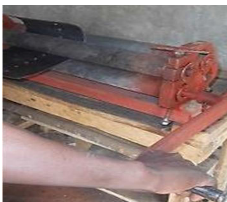
Step 4: Roll up the fuel chamber to form a round shape using a slip roll. The outer cowling will form a rounded cylinder without requiring any tool. Bring the two ends together.