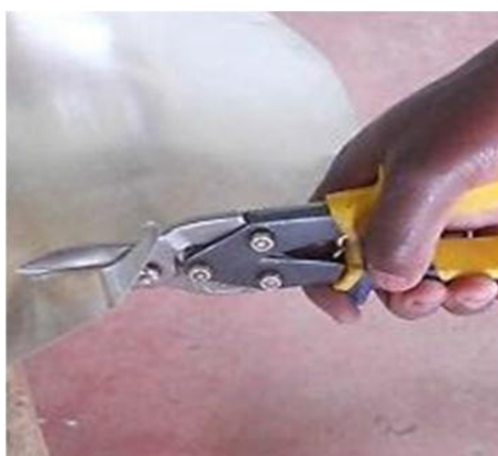
Step 2: Cut out the pieces carefully using the right tool. Use gloves whenever you are dealing with sharp edges.