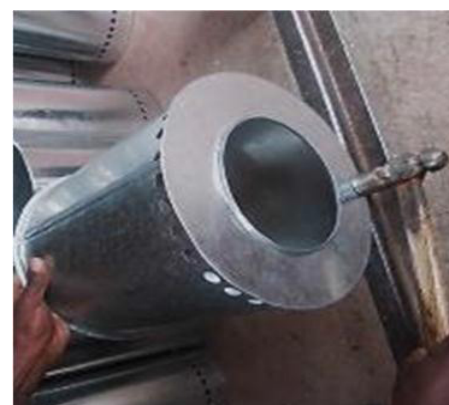
Step 6: Put a seam around the inner edge of the bottom cowling and then join it to the cylinder using the single bottom seam.