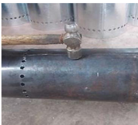
Step 5: The 2 ends of the fuel chamber are joined as well as the cowling. The lap seam requires riveting as well. Steel rivets should be used.