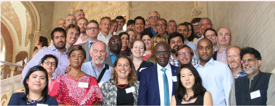
Participants at the gathering in Barcelona.

Throughout the consultations, lessons were drawn from local government representatives who are dealing with recent and ongoing urban crises in Senegal, Bangui (CAR), Banda Aceh (Indonesia) and Turkish cities where refugee influx has doubled the population without extra resources to ensure basic services. In addition, participants articulated key principles in a draft 'charter' as the basis for a Global Urban Partnership, pooling knowledge, capacity and resources to take this agenda forward. The consultation ended with a marketplace designed to connect key partners together to help shape these important initiatives.