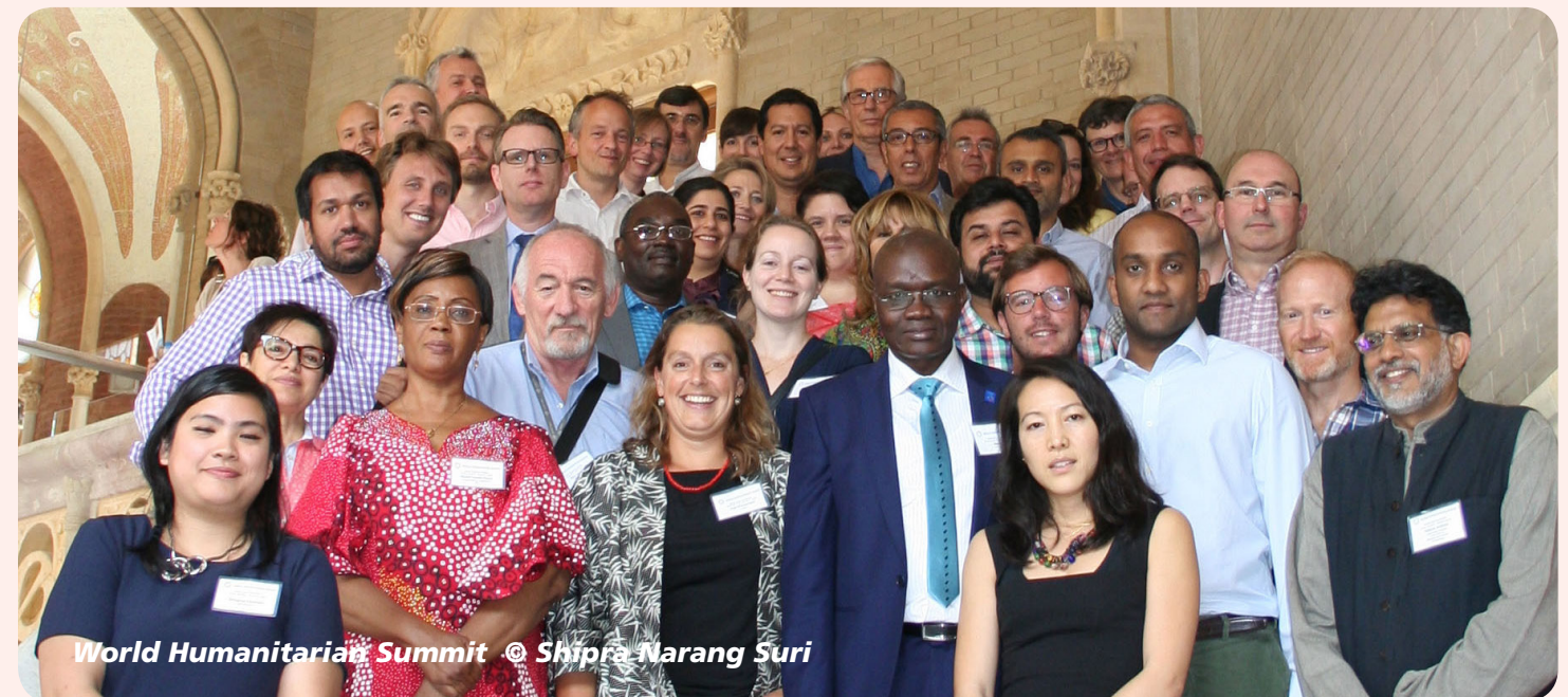
World Humanitarian Summit © Shipra Narang Suri