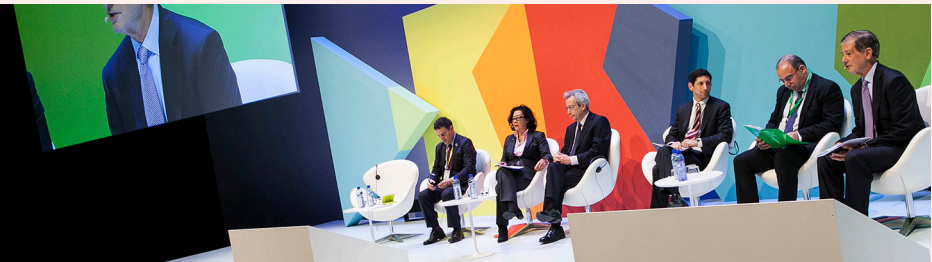
Speakers at one of the sessions of the SCEWC 2014

On Wednesday 18, a parallel session on Habitat III – Towards a New Urban Agenda, will have a slot to highlight the importance of the Conference on Housing and Sustainable Urban Development to take place in Quito, Ecuador, from 17 – 20 October 2016. Considered as one of the thematic meetings which are based on specific and relevant topics will issue thematic recommendations for the preparatory process towards Habitat III.