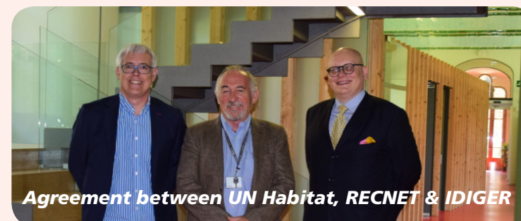
Agreement between UN Habitat, RECNET & IDIGER