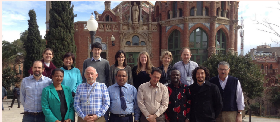
Participants at the CRPP Partner Cities Summit.

For two days, CRPP Focal Points and local government representatives from Balangoda (SRL), Cagayan de Oro (PHL), Barcelona (SPA), Dar es Salaam (TZA), Beirut (LBN), Tehran (IRN), Lokoja (NGA), and Bogota (COL) as a representative of the CRPP Associate City Network, gathered in this intensive working session to review and share progress and results in the implementation of the CRPP Tool in their cities. The discussion forum supported the exchange of information, challenges and opportunities for both, cities and CRPP, during the process.