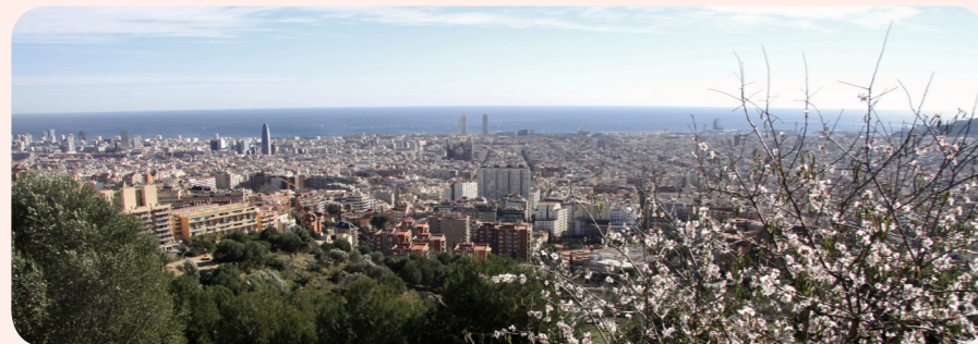
Barcelona, Spain

In this respect, I would like to highlight the tight collaboration with CRPP's working team, based in Barcelona, in the description of a systemic and holistic approach to measure resilience, fully in line with the current development of the city's Resilience Plan, and an essential tool to help identify the main lines of action and measures to be implemented in order to reduce the vulnerabilities of the city.