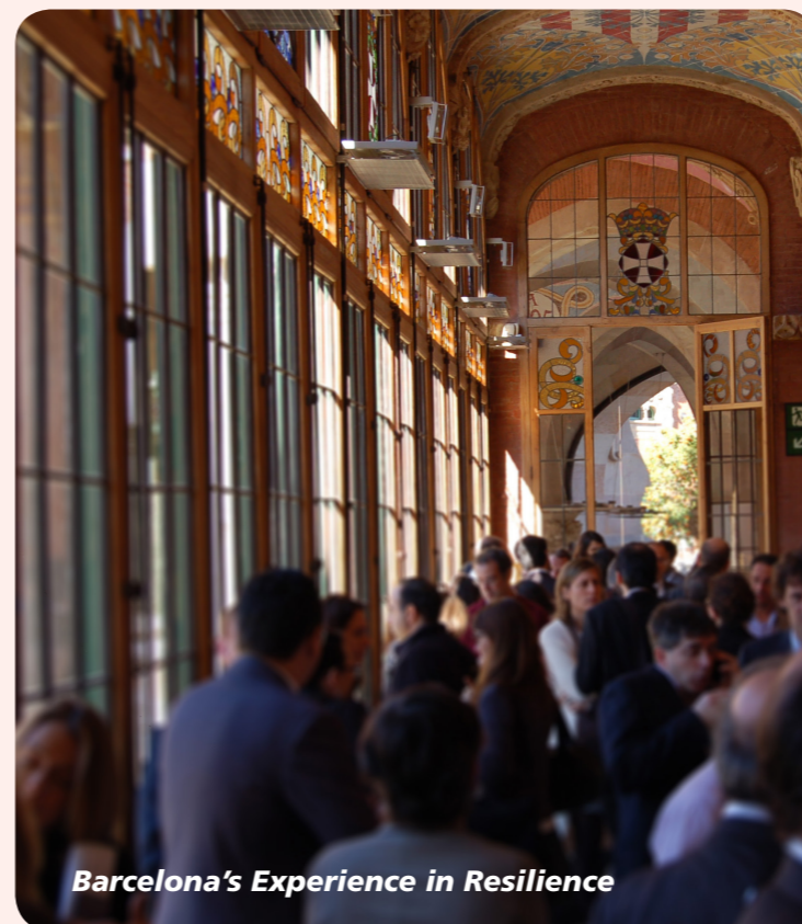
Barcelona's Experience in Resilience