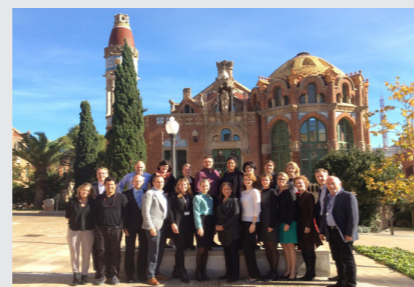
Delegates at the Medellín Collaboration on Urban Resilience Workshop

The workshop brought together more than 20 attendees from the public and private sectors, including several members from the Collaboration, which includes UN-Habitat, the United Nations Office for Disaster Reduction (UNISDR), The Rockefeller Foundation, 100 Resilient Cities – Pioneered by the Rockefeller Foundation, the World Bank, the Inter-American Development Bank, the Global Facility for Disaster Reduction and Recovery, the C40 Cities Climate Leadership Group, and ICLEI-Local Governments for Sustainability.