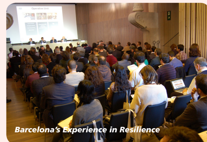
Barcelona's Experience in Resilience