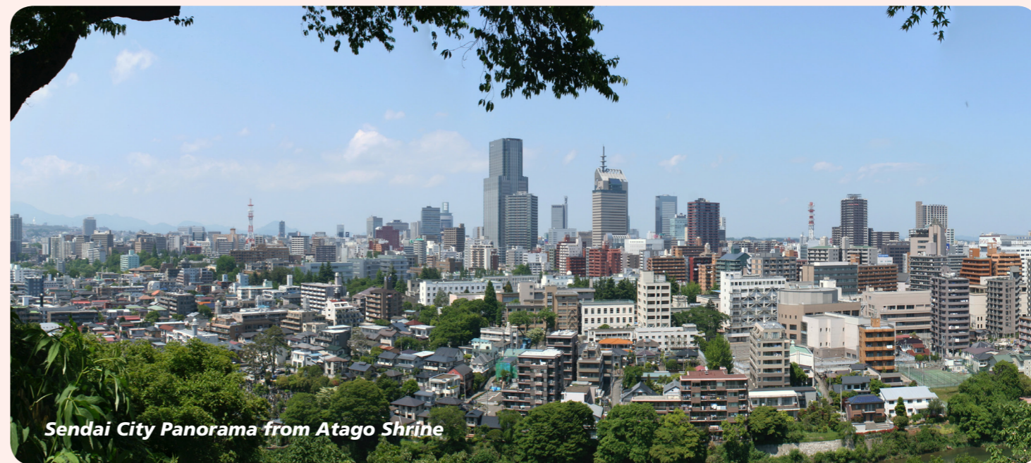
Sendai City Panorama from Atago Shrine