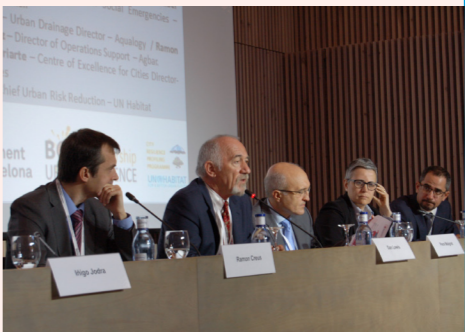
Barcelona's Experience in Resilience