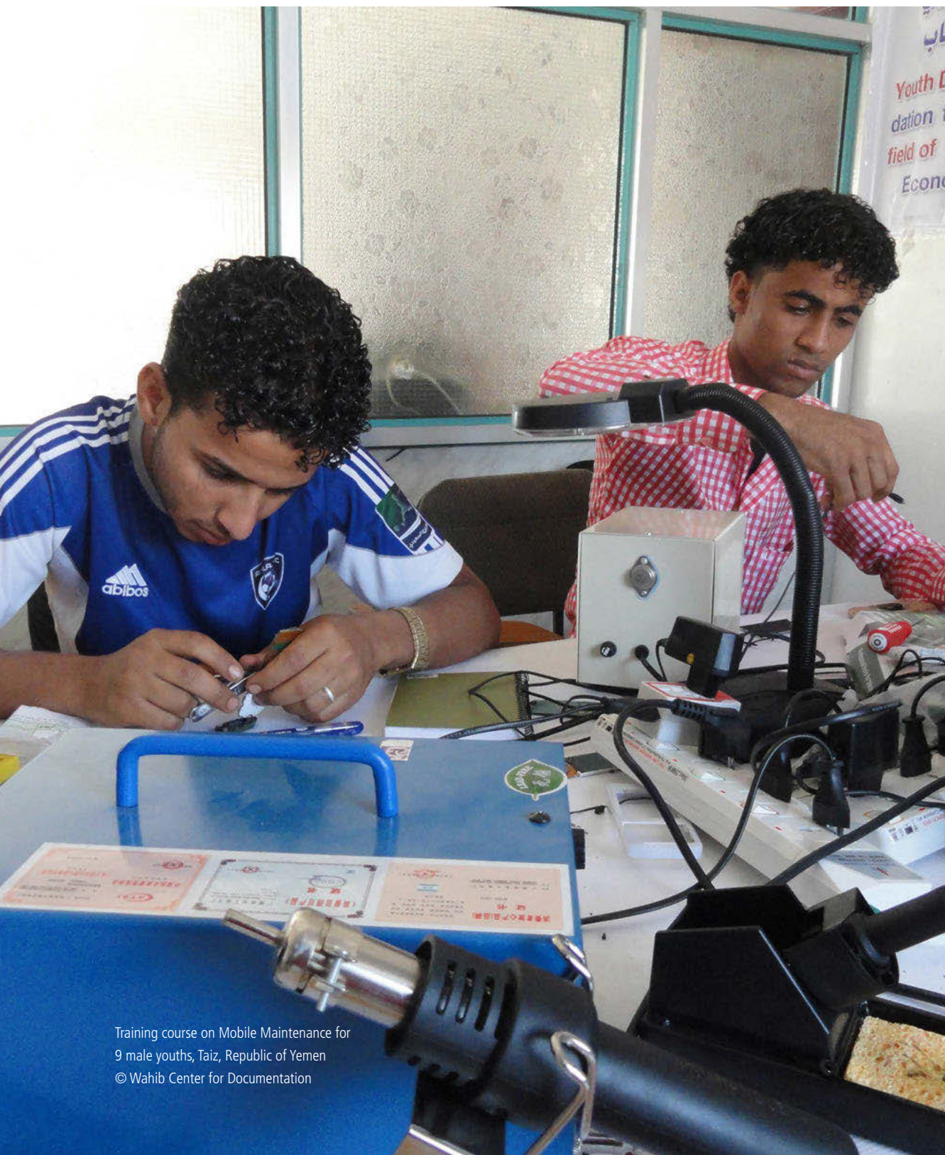
Training course on Mobile Maintenance for 9 male youths, Taiz, Republic of Yemen