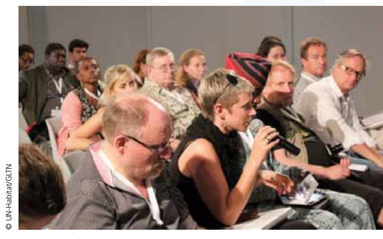
Youth Assembly World Urban Forum

Youth is a transitional phase and youth's relationship to land needs to be addressed in this light. Land is