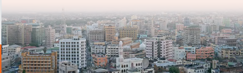
Dar es Salaam is one of CRPP's 10 Partner Cities