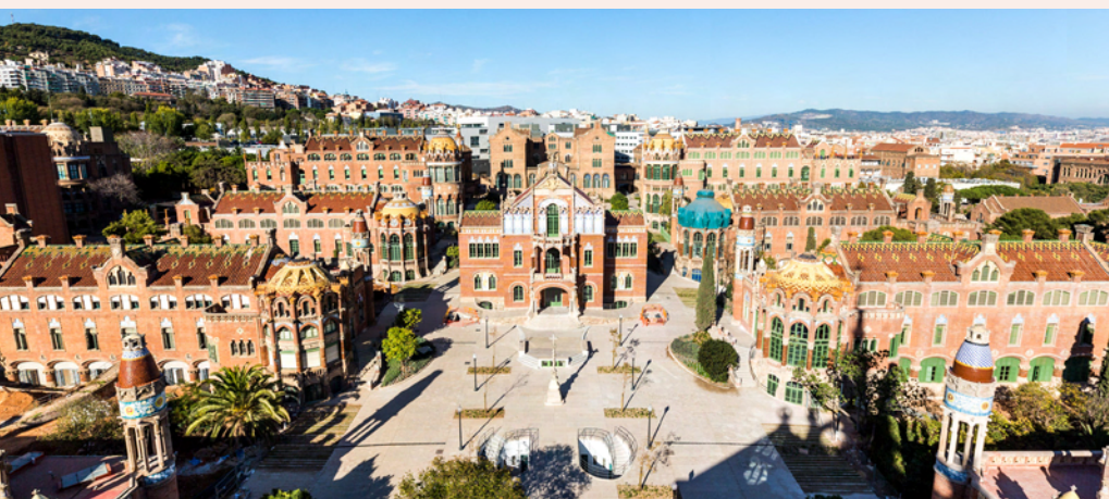
URI is located in Sant Paul Art Nouveau Site in Barcelona