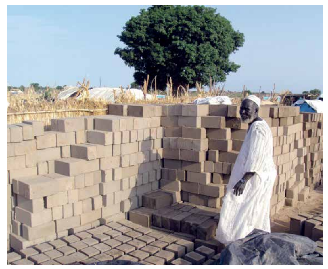
UN-Habitat / DFID / Gov. of Japan - Sustainable Reconstruction of Shelter, Community Infrastructure and Land Tenure - Southern Darfur

The United Nations Human Settlements Programme (UN-Habitat), according to its mandate, supports the Government of Sudan in developing and implementing sustainable urbanisation strategies. In Sudan, the approach and kind of activities implemented differ according to each region of intervention (see map on page 9). In general, UN-Habitat tries to combine policy-making with informed technical advice and translate this effort into concrete implementation of demonstration activities at ground level, by mainstreaming participatory approach, institutional capacity development and community involvement. Activities commonly carried out by UN-Habitat in Sudan include, among others, the construction of housing and social services using eco-friendly and low-cost construction technologies (such as stabilised soil blocks - SSB), participatory urban and regional planning, awareness raising and training, and slum upgrading interventions. The main objective of UN-Habitat work in Sudan is to bring together national and international expertise and political will for promoting more sustainable urbanization processes and dynamics, helping people in need through the implementation of durable and environmentally sustainable solutions to reduce their dependency from humanitarian aid.