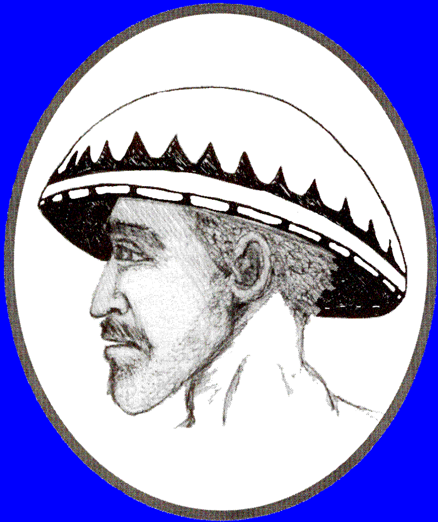
Decorative head cover of Balinese salt harvesters

The hat worn by the figure to the right and shown on the pages to come was selected to symbolize the councillor role featured in this handbook.