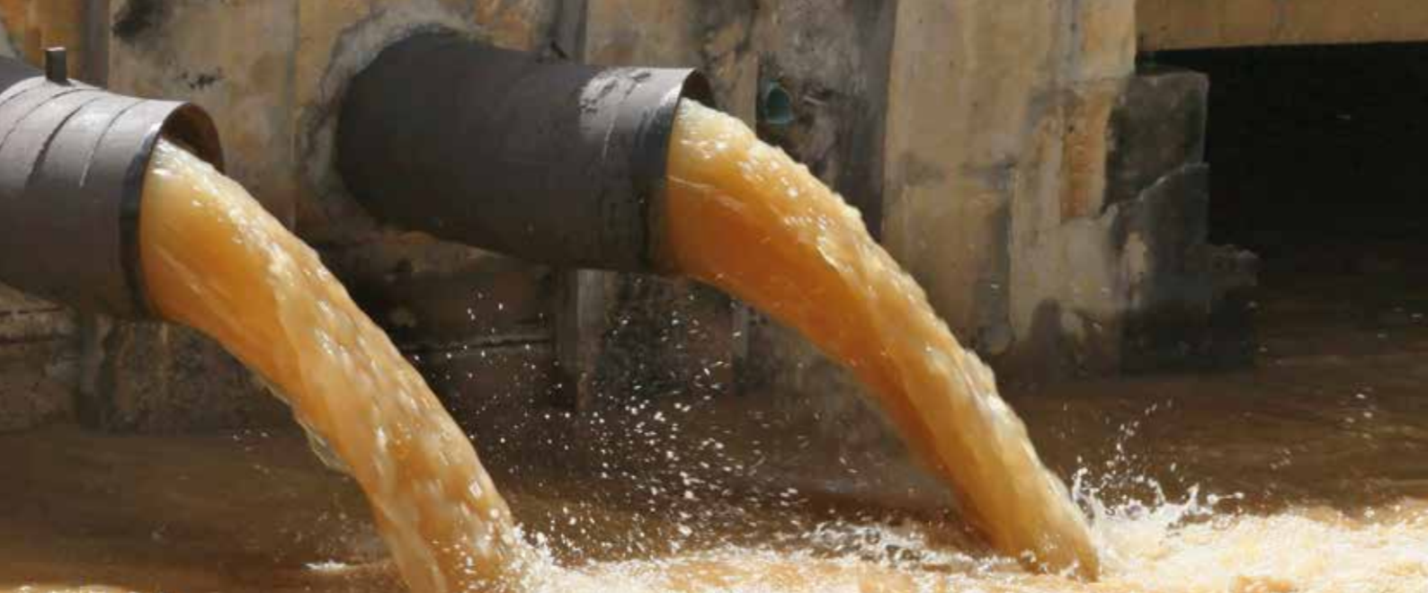
Water flowing at a wastewater treatment facility.