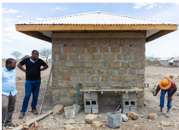
A mason finalising on shelter finishings.

The shelters constructed consists of internal partitions separating sleeping and living areas from the kitchen. The doors to the shelters are durable, strong and wide enough to accommodate wheelchairs and equipped with ramps for ease of access. In addition, 15 shelters are constructed of locally sourced, natural Turkana solid blocks while 5 shelters were constructed of hollow blocks. The shelter design can be adopted by other partners and scaled up to more areas within the settlement too.