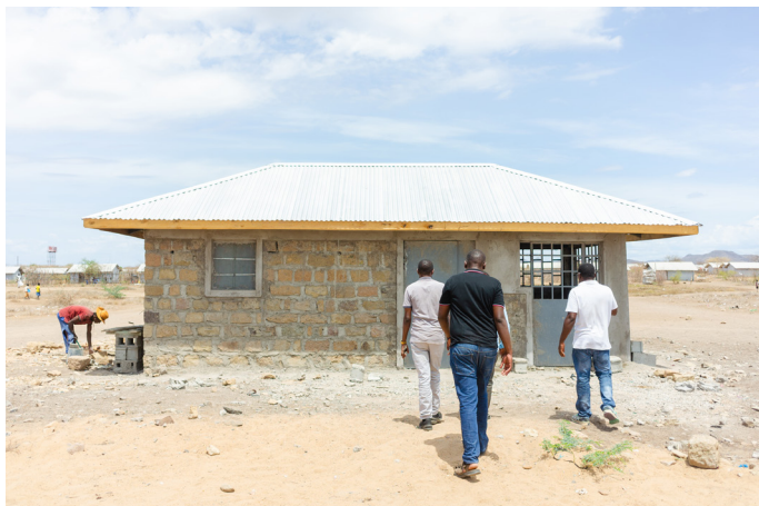
UN-Habitat and NCK Technical team inspecting a completed shelter.