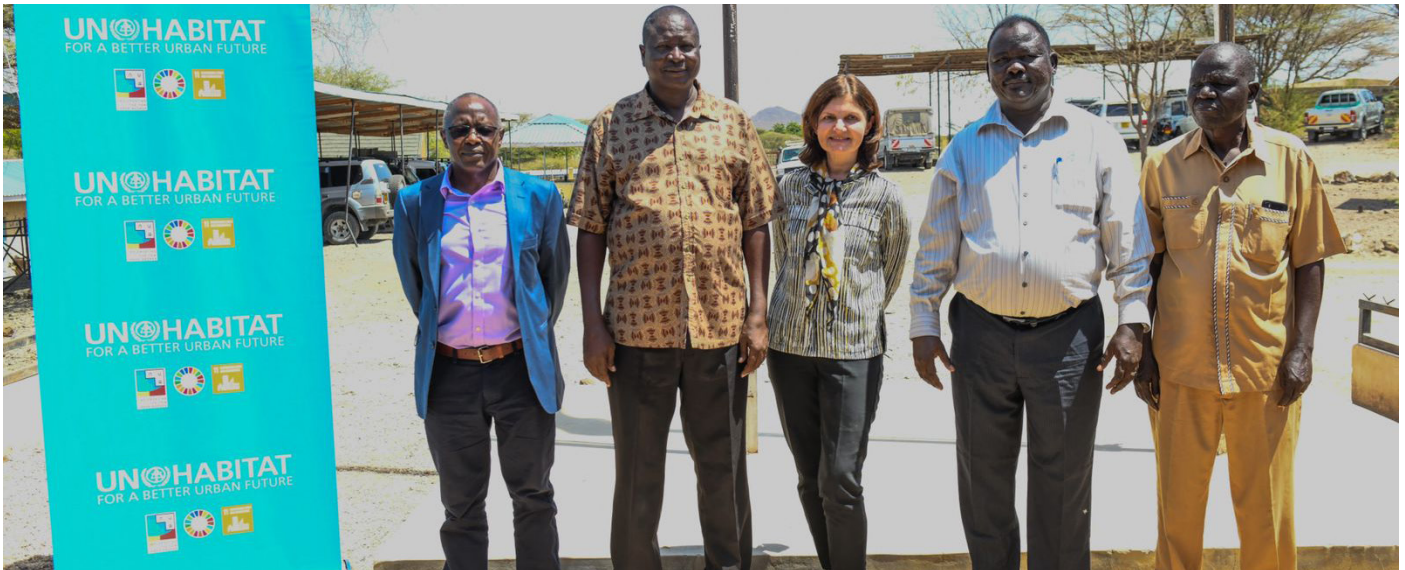
UN-Habitat is committed to working closely with Turkana County Government to develop sustainable urbanization for all in Turkana.

Conducting situational analysis to inform urban planning processed; Institutional capacity in relevant ministries in planning, administration, and governance to be enhanced; Strengthening land management through land governance, adjudication processes including housing land and property rights, and supporting of environmental management, climate change adaptation and mitigation strategies.