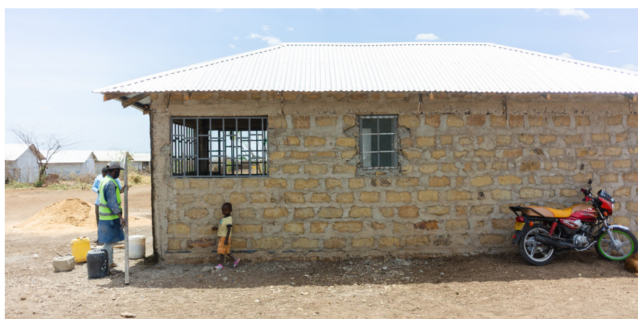
Shelter with metallic window grills.

This process was initially triggered by the potential affects that the COVID-19 pandemic has had on the existing facilities and housing within the camp and the settlement setting. In the wake of COVID-19 outbreak a lot of direct or challenges and inequalities were anticipated because of the existing housing type and conditions. There was also a greater need to strengthen the need for involvement of persons with special needs in shelter planning, design and construction. This called for a need for a deeper understanding of the situation to effectively plan, respond and adapt amidst the existing challenges exacerbated by the COVID-19 Pandemic. Essentially, exposed and localized challenges and opportunities regarding shelter habitability and functionality within the settlement should be explored and addressed.