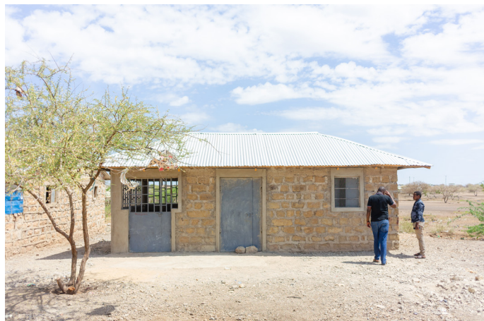
UN-Habitat Team checking a near complete shelter.

This process was made possible as a result of a partnership between UN-Habitat and UNHCR who were key collaborators in the stages of beneficiaries' selection, site planning and identification, as well as shelter design. Other partners included NGOs working on protection and health issues in the settlement such as Humanity and Inclusion (HI), Danish Refugee Council (DRC), Kenya Red Cross Society (KRCS) and AICHM.