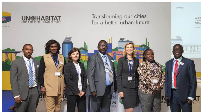
UN-Habitat, Turkana County Government and IFC participants attending WUF 11.