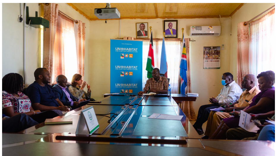
Official representatives from UN-Habitat and Turkana County during the MoU signing ceremony.