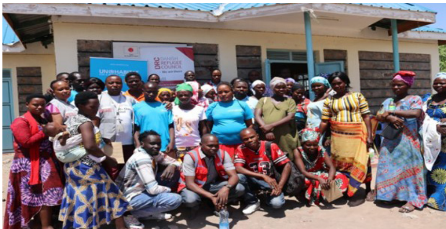
Group photo after awarding the grants to the host and refugees.

Out of the 70 applicants who applied, 60 applicants were selected to participate. 19 women participated in Tie & Dye, 31 women in Pastry Making, and 10 (2 women, 8 men) for Screen Printing. Out of the 60 businesses that were trained 30 of them qualified for short listing to receive grants to support their business initiation or growth.