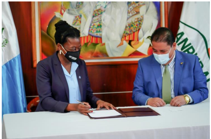
Signing of the agreement between the CEO of the Banrural bank and UNHCR's representative in Guatemala, Besem Obenson.