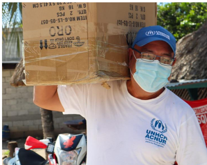
Provision of 90 blankets to the migrant shelter in Santa Elena, Flores, Peten, in response to the heightened mixed movements.

The daily mixed movements have increased from the beginning of January 2022, notably of Venezuelans. In addition, on 15 January several groups of a total of approximately 600 people, mainly from Honduras and Nicaragua, left from San Pedro Sula, Honduras, towards El Corinto border, Izabal, Guatemala. UNHCR's partners Guatemalan Red Cross, Pastoral de Movilidad Humana, Refugio de la Niñez, and the Human Rights Ombudsperson's Office through its mobile unit, provided information and humanitarian assistance such as basic medical care, hygiene kits, snacks, water, phone calls and shelter, while identifying people in need of international protection. Furthermore, through the Working Group on Migration and Protection UNHCR's Field Unit in Puerto Barrios coordinates with local governmental institutions and civil society organizations, to ensure forcibly displaced people have access to the Guatemalan asylum system.