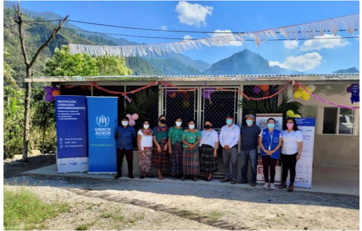
Inauguration of the new community centre in the village Nuevo Queja, San Cristobal Verapaz, Alta Verapaz.