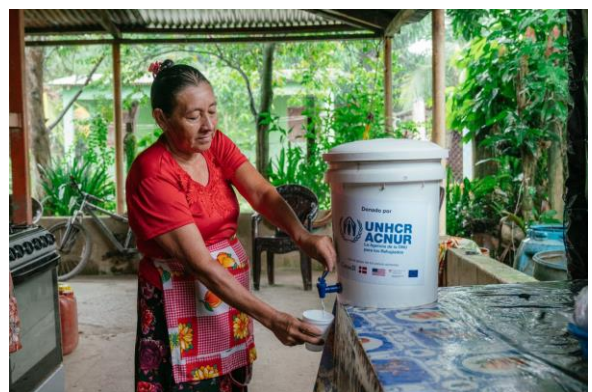
A woman of a solidary family provides drinking water and information to people on the move in Izabal on the border with Honduras.