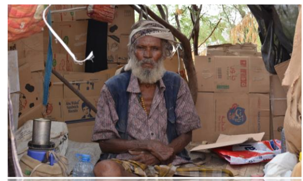
An elderly displaced Yemeni in need of shelter and protection support in a site in Al-Hudaydah Governorate, Yemen, 12 July 2021

As the Shelter Cluster lead for IDPs in Yemen, UNHCR provides emergency shelter and basic household items such as mattresses, blankets, kitchen sets and solar lamps, especially to newly displaced families. UNHCR has produced emergency shelter kits adapted to the local weather and locally procured materials, contributing to the local economy and assisting recently displaced individuals become self-sufficient. UNHCR also upgrades emergency shelters, providing dignified and sustainable shelters for up to five years. The Operation further supports IDPs at risk of eviction through rental subsidies. In 2022, UNHCR aims to provide rental subsidies to some 54,000 vulnerable IDP families and distribute 55,000 emergency shelter kits, 20,000 transitional shelters and 70,000 core relief item kits.