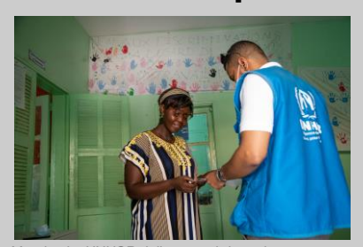
Mauritania. UNHCR delivers cash-based interventions (CBI) through prepaid cards to refugees in urban areas / 8 October

UNHCR remains committed to "stay and deliver" and is providing protection and life-saving assistance to refugees and asylum-seekers by adjusting its programme under the COVID-19 crisis. UNHCR is supporting the Government of Mauritania Covid-19 response. Almost 17,700 refugees have already been vaccinated in Mbera refugee camp (25,8% of the total population living in the camp) thanks to the mobilization of refugees in Mbera refugee camp, and the good coordination between refugee leaders, humanitarian partners and UNHCR. UNHCR has expanded the Cash Based Interventions to help refugees and vulnerable households of the host community overcome the situation which has been worsened by the loss of income sources.