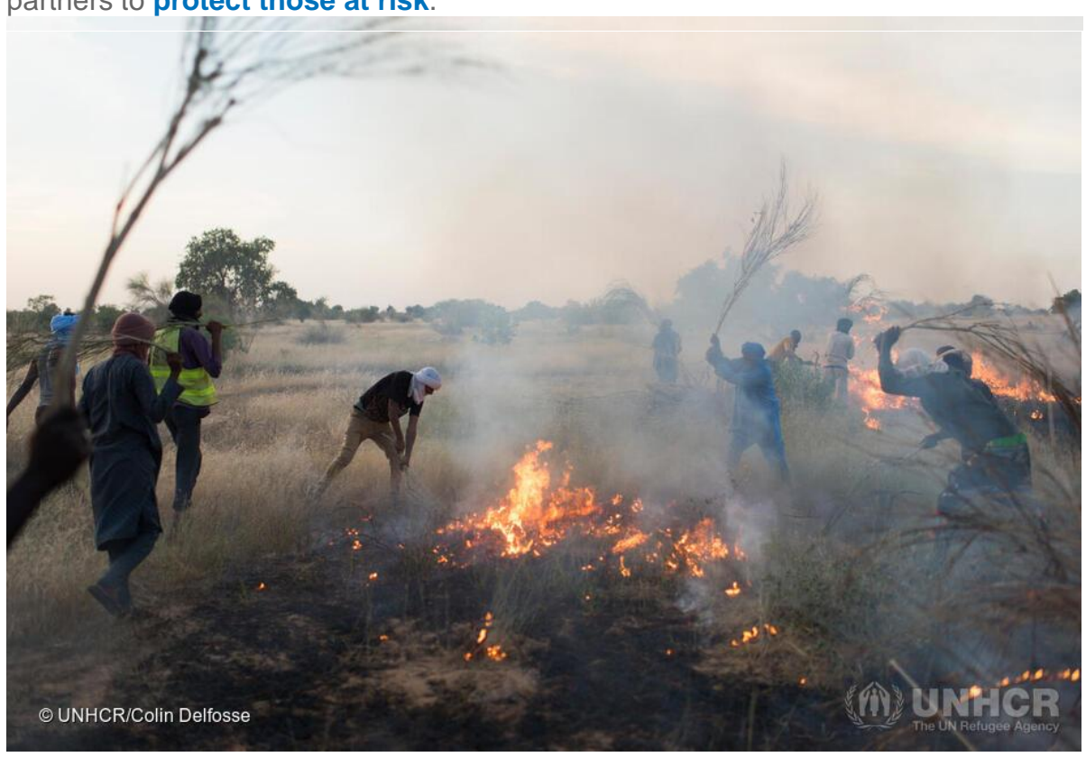
Mauritania. Refugee volunteers wage fight against bush fires near Malian camp.

UNHCR is deeply concerned about the massive challenges raised by disasters and climate-related displacement , and works with other agencies and a range of partners to protect those at risk .