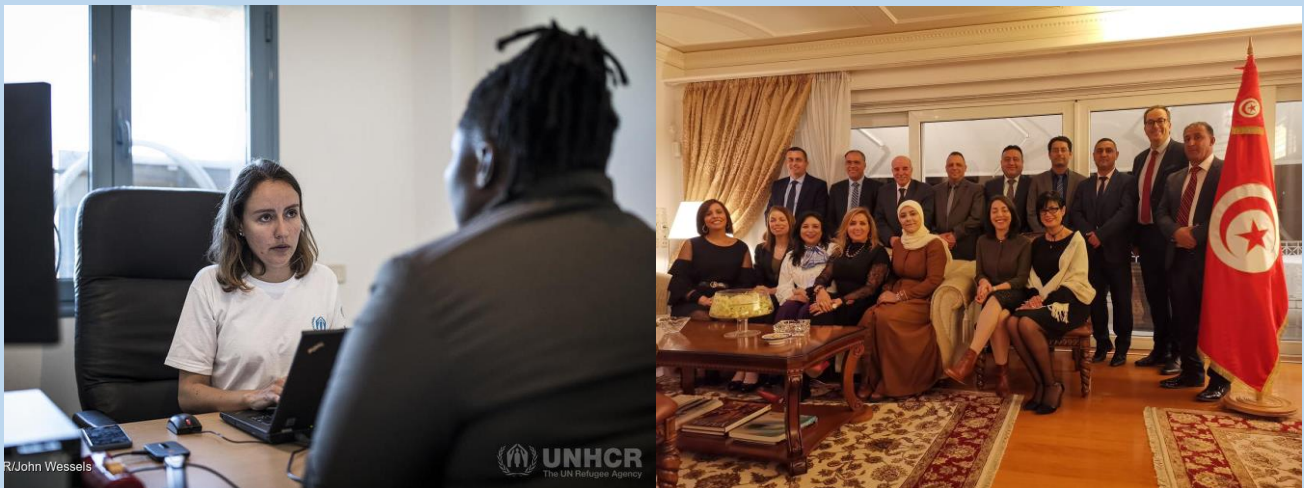
Left: UNHCR staff conduct RSD interviews in Medenine in 2019, Right: Tunisian officials participate in a study visit to Greece in 2020

RDPP NA is funded by the European Union (DG HOME) and co-funded by the Italian Ministry of Interior, who also leads on a consortium of 13 EU member states participating in the programme. UNHCR Tunisia is grateful for their ongoing generous support.