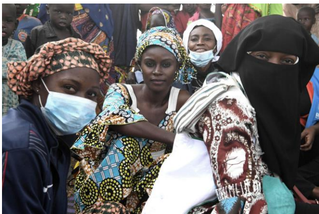
Far North Cameroon. 12/01/2021 – Internally displaced women at the informal site where they settled after fleeing inter-communal clashes with their families.

According to pre-registration of refugees in Chad and the protection needs assessment mission in Cameroon.