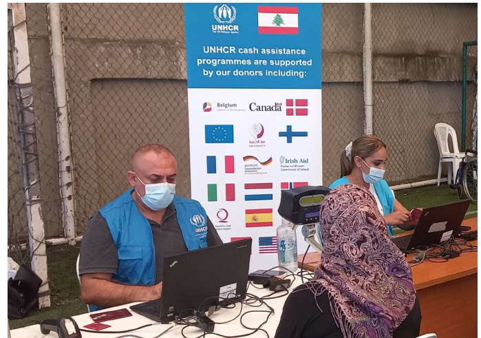
Card distribution/validation exercise at Choueifat site in Mount Lebanon

UNHCR has a robust financial control, verification, and monitoring system to ensure that cash assistance reaches the identified target families and helps them meet their basic needs. This includes periodic biometric identity verification and validation of beneficiary identity before cash-uploading for those who already possess an ATM card and secure bank upload instructions. Monitoring is also conducted through post distribution and withdrawal monitoring, focus group discussions, and surveys. Moreover, regular contact with recipients allows UNHCR to assess and update information on refugees and monitor impact.